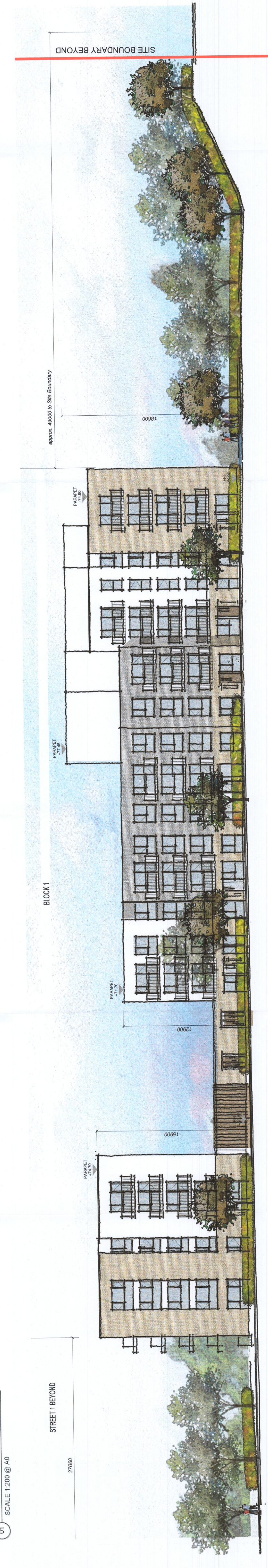
01 SECTION B - B (cont.) SCALE 1:500 @ A0