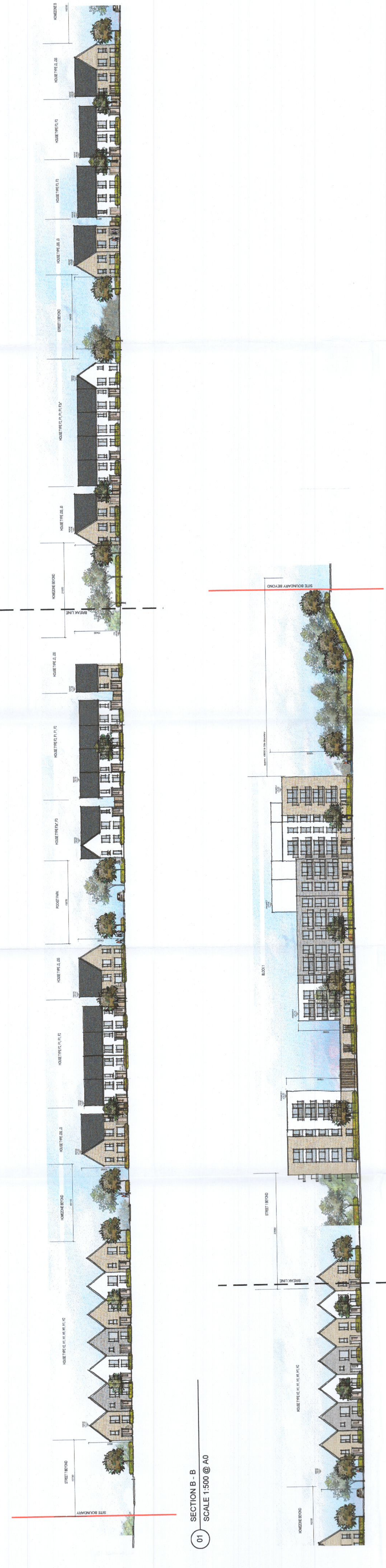
01 SECTION B - B SCALE 1:500 @ A0