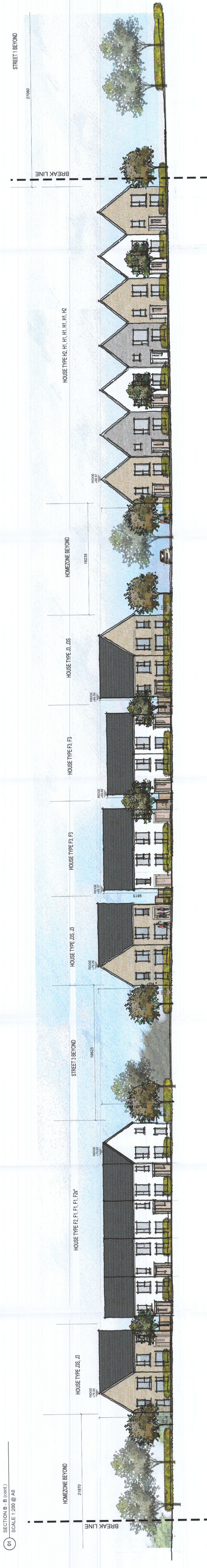
01 SECTION B - B (cont.) SCALE 1:500 @ A0