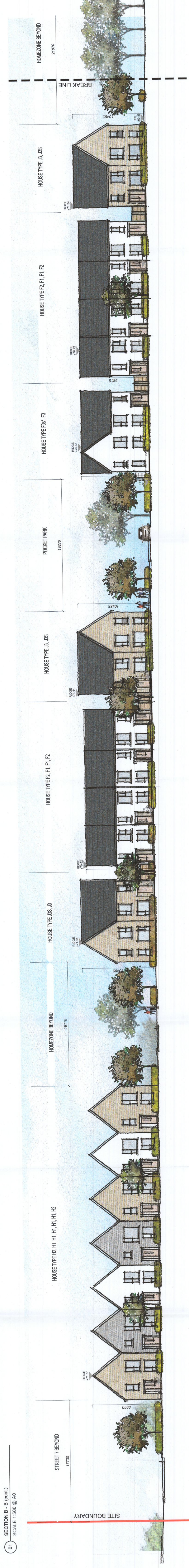
01 SECTION B - B (cont.) SCALE 1:500 @ A0