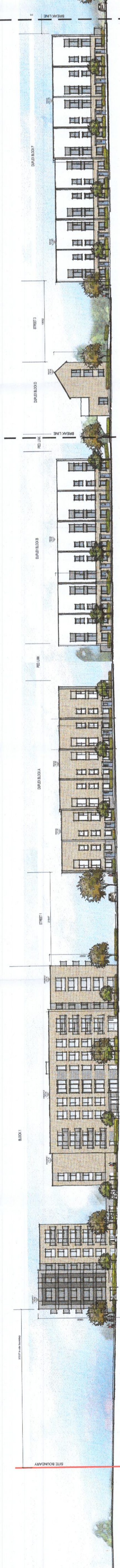
01 SECTION A-A SCALE 1:500 @ A0