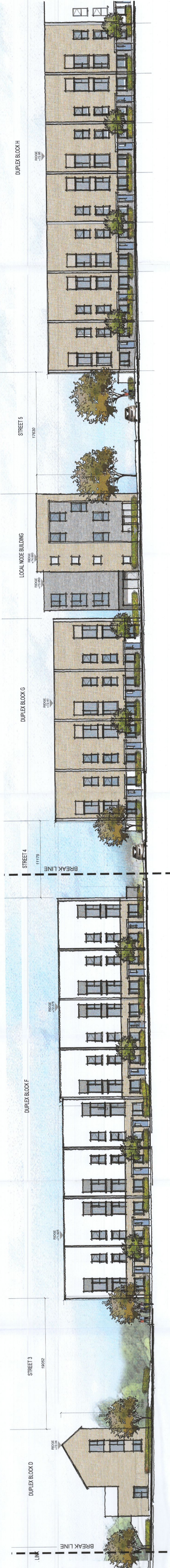
03 SECTION A-A (cont.) SCALE 1:200 @ A0