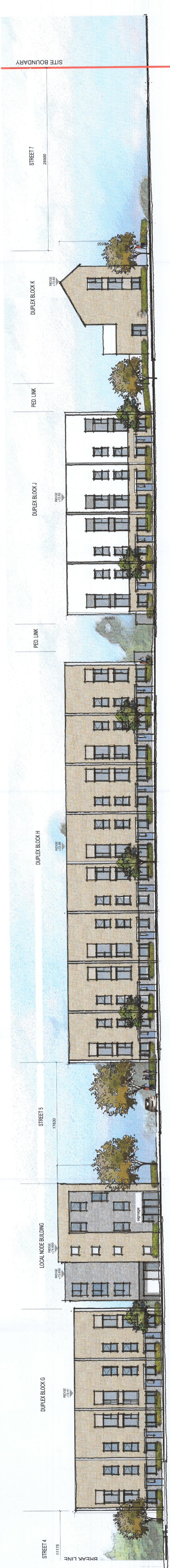
03 SECTION A-A (cont.) SCALE 1:200 @ A0

NOTES: DO NOT SCALE FROM THIS DRAWING. FOR DIMENSIONS, REFER TO ARCHITECTS DRAWINGS. ALL DIMENSIONS SHALL BE VERIFIED IN THE FIELD.