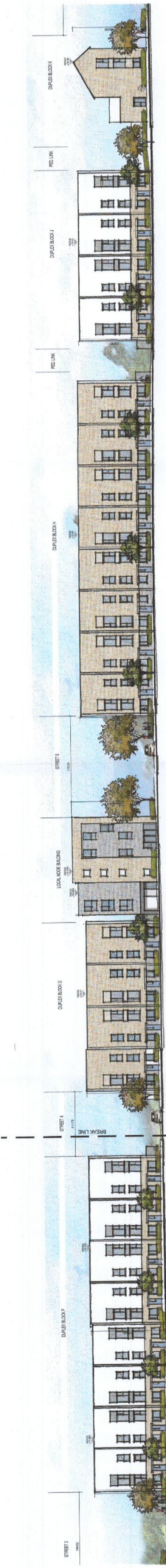
01 SECTION A-A (cont.) SCALE 1:500 @ A0