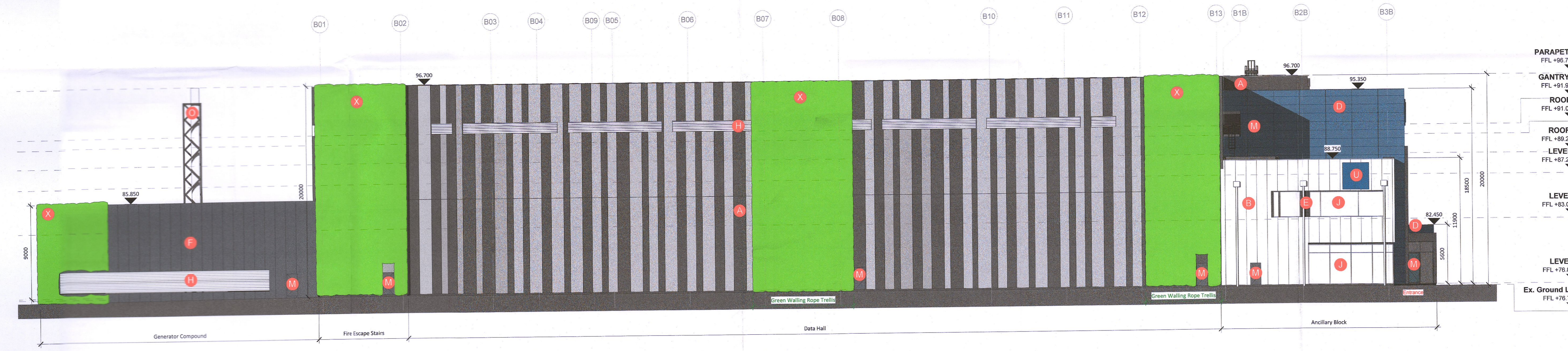
2 04051 DUB16 East Elevation 1 : 200