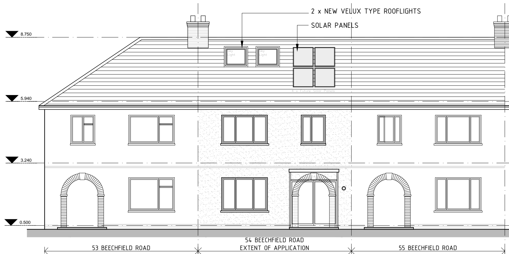
01 FRONT ELEVATION - PROPOSED SCALE 1:100