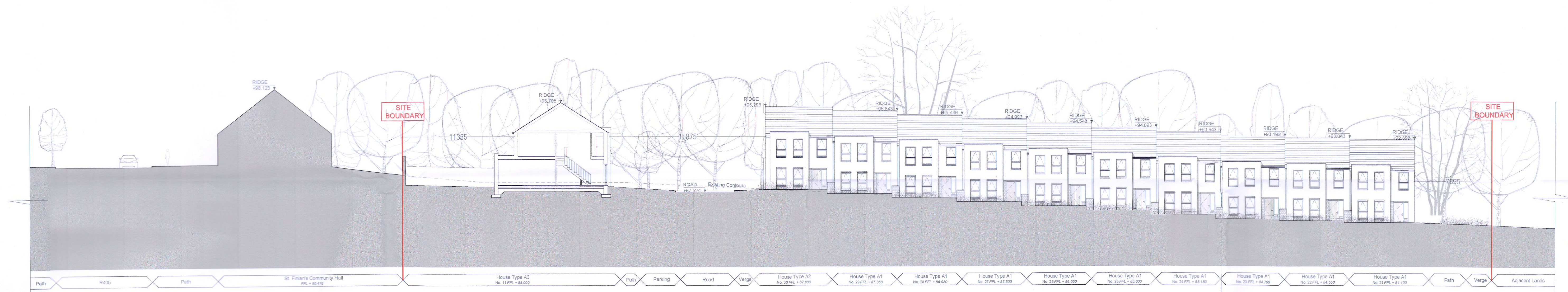
Contiguous Elevation - View 2-2