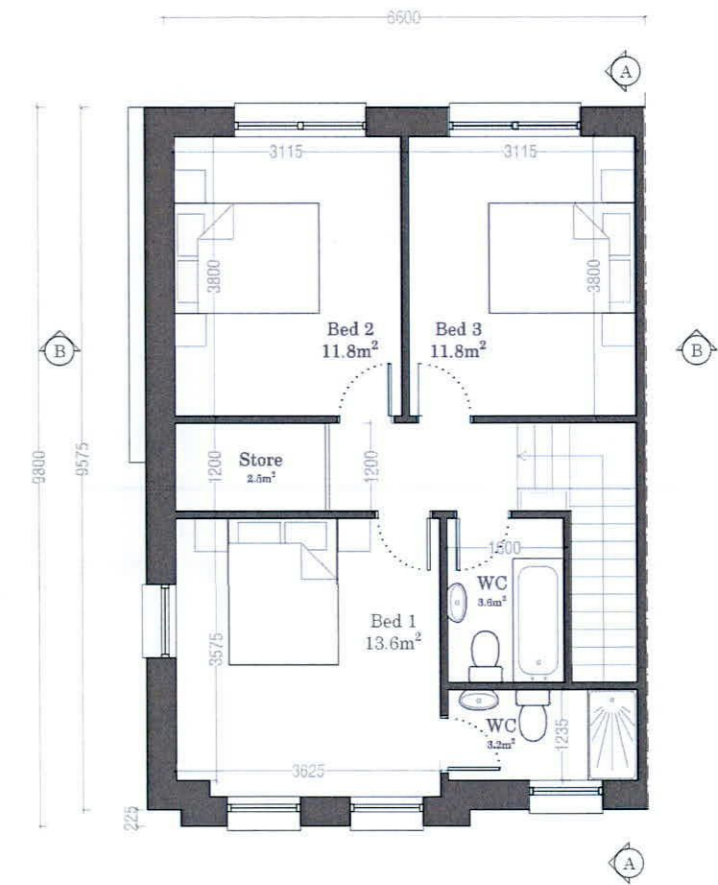
House Type A2 - End Terrace First Floor Plan 56.2m 2