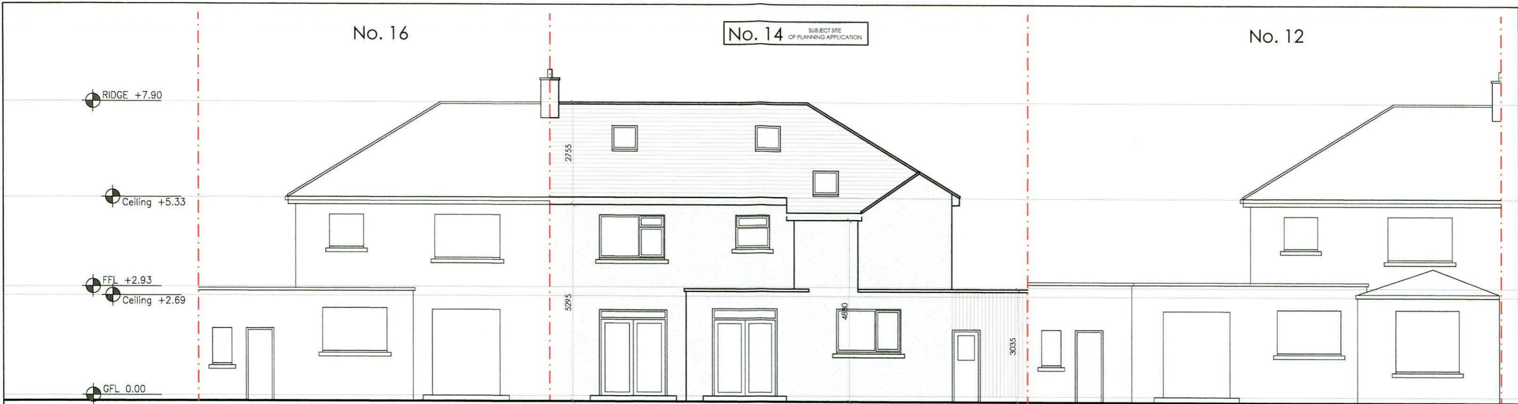
EXISTING CONTIGUOUS REAR ELEVATION [northwest] scale 1:100 @ A3