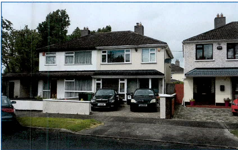
Existing Front (Southeast) NTS