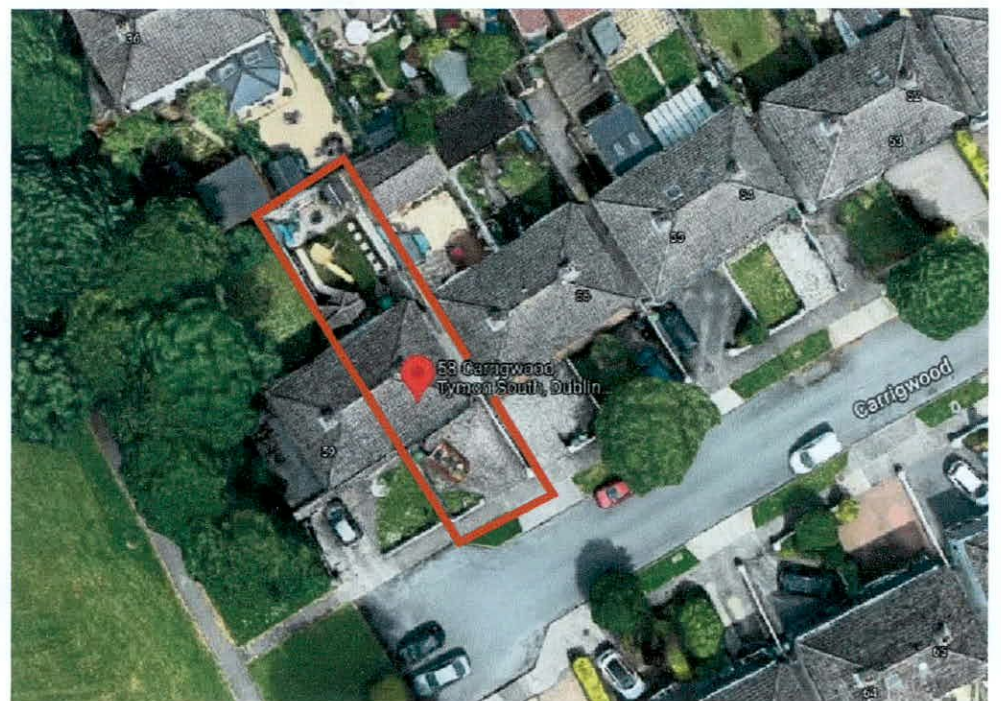
Aerial Map Site Photo 1: 500 (+/-)