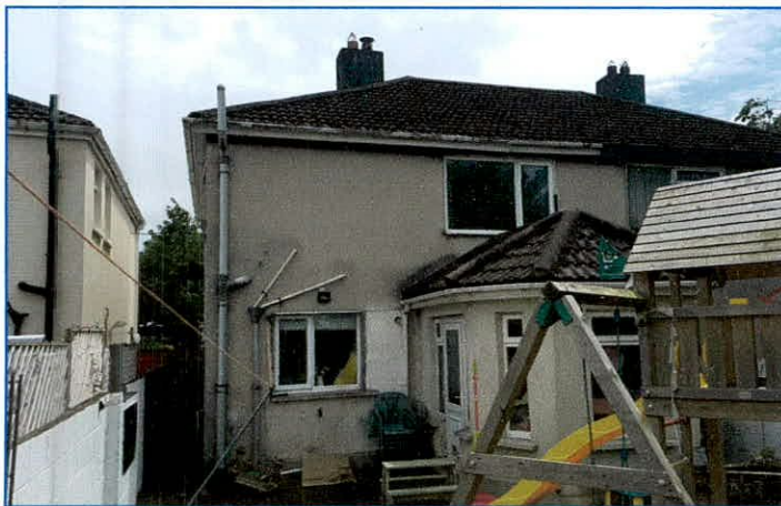
Existing Rear (Northwest) NTS