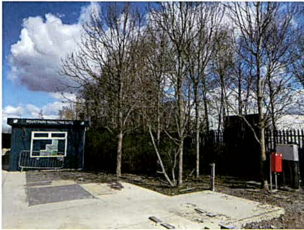
Tree Group 2