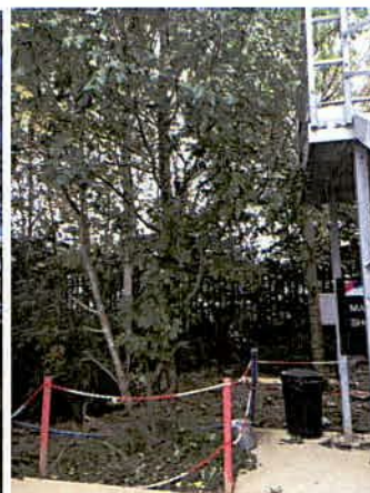
Tree Group 1