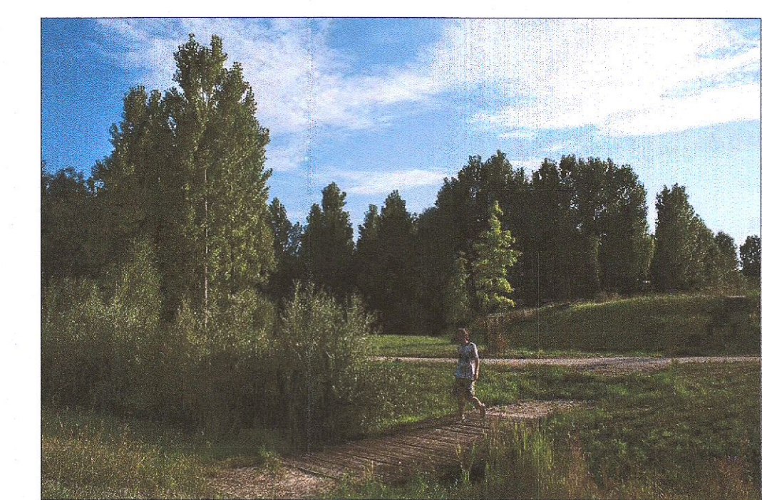
Open Spaces to have focus on low maintenance, nature and biodiversity. Native planting, woodlands and meadows are proposed within a connected path network. The retention of existing vegetation to the canal bank and pNHA boundary is of primary importance.