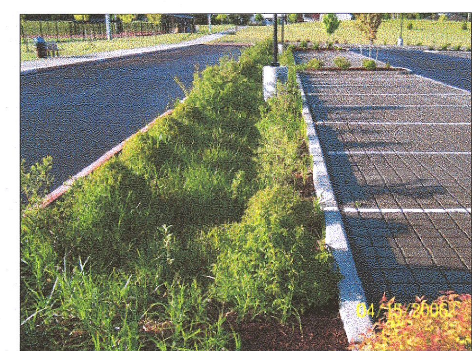
Planted Swale/Rain Garden