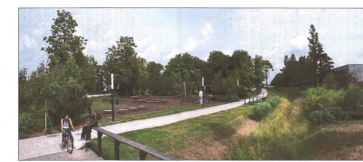
Integration of paths, seating areas, natural play spaces and SuDS elements form the open space network

1. This drawing is intended to show landscape architectural proposals only. Please refer to Architects and Engineers drawings for relevant details of outfalls, structures, roads, parking, etc. 2. The copyright of this drawing is vested with Murray & Associates. This drawing may not be copied or reproduced without written consent. 3. All materials referred to on this drawing, including plant species, are indicative and subject to change following detailed site investigation. Significant changes, if any are required, will be referred to the relevant authority for agreement. 4. This drawing is not suitable for use for construction purposes. 5. Drawings to be referred to Murray & Associates for confirmation.