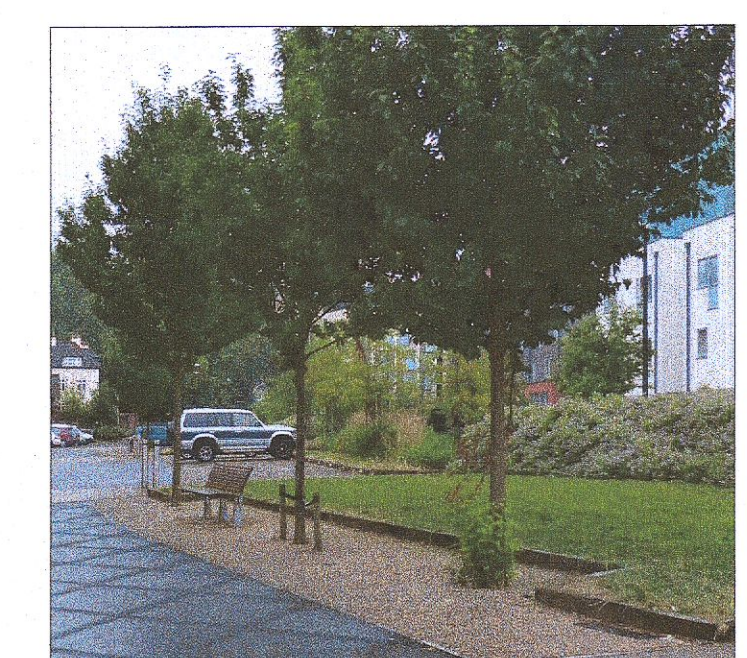
Tree planting with connected linear tree pits