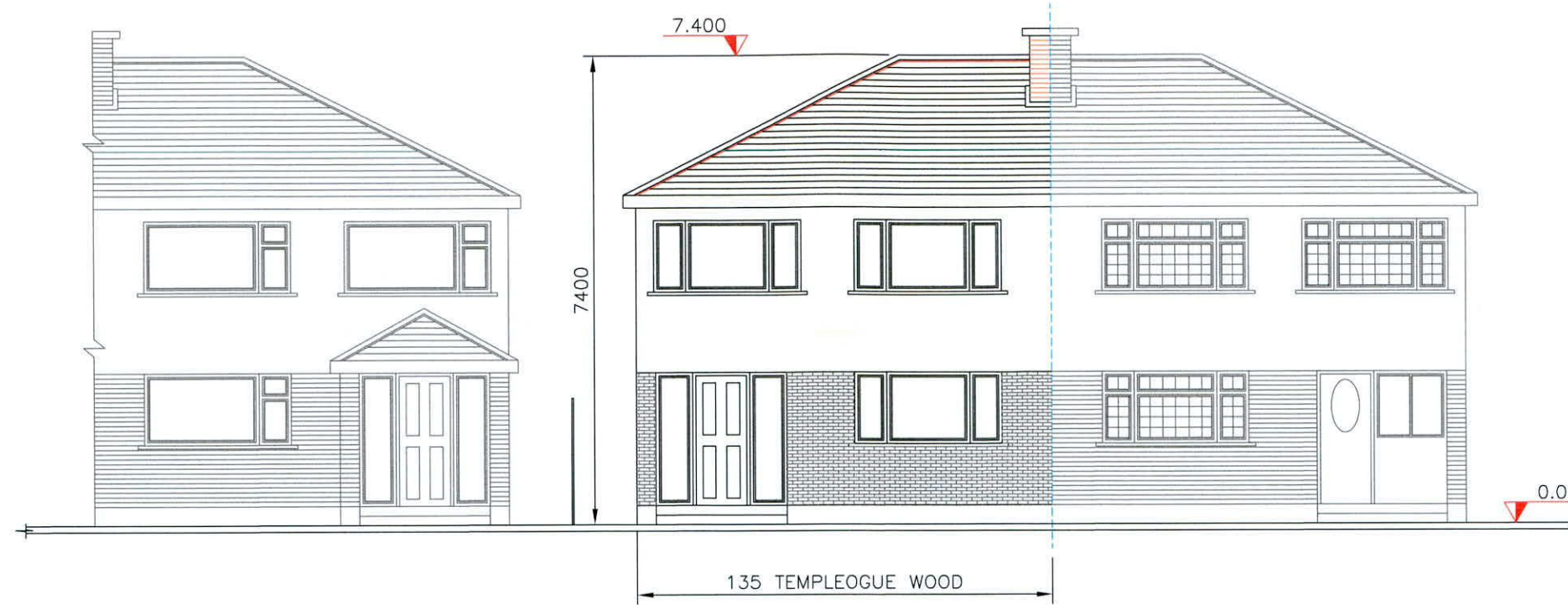
EXISTING FRONT ELEVATION - CONTIGUOUS