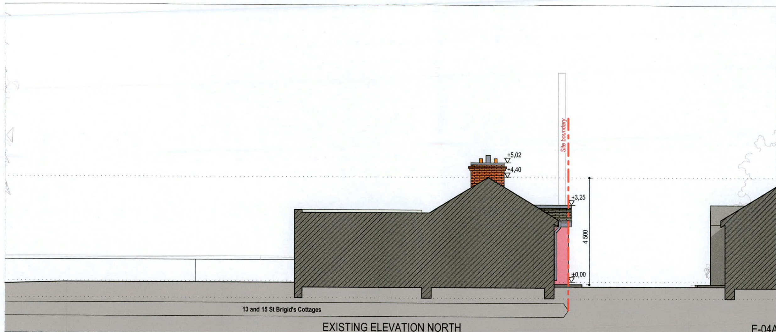
13 and 15 St Brigid's Cottages