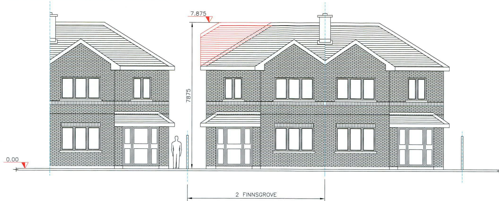
PROPOSED FRONT ELEVATION - CONTIGUOUS