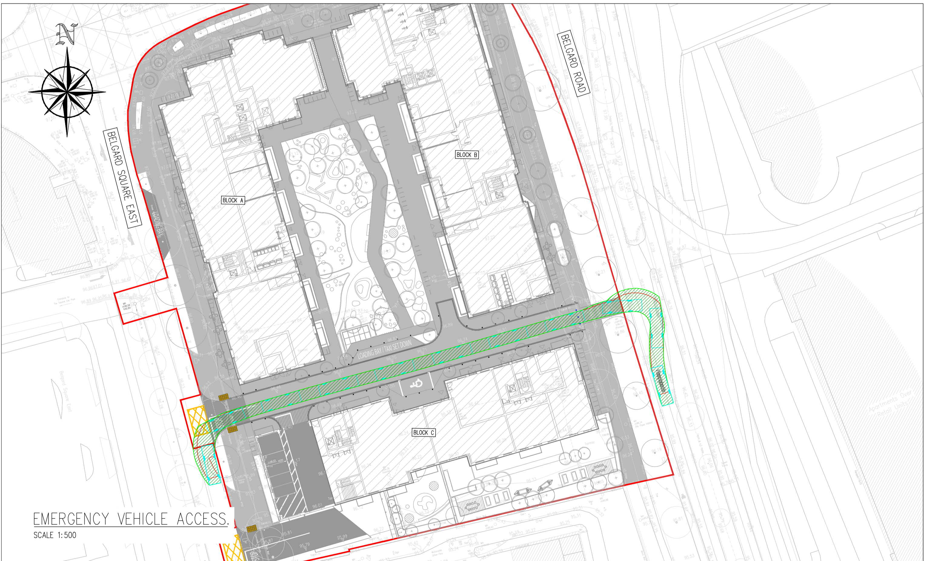
EMERGENCY VEHICLE ACCESS. SCALE 1:500