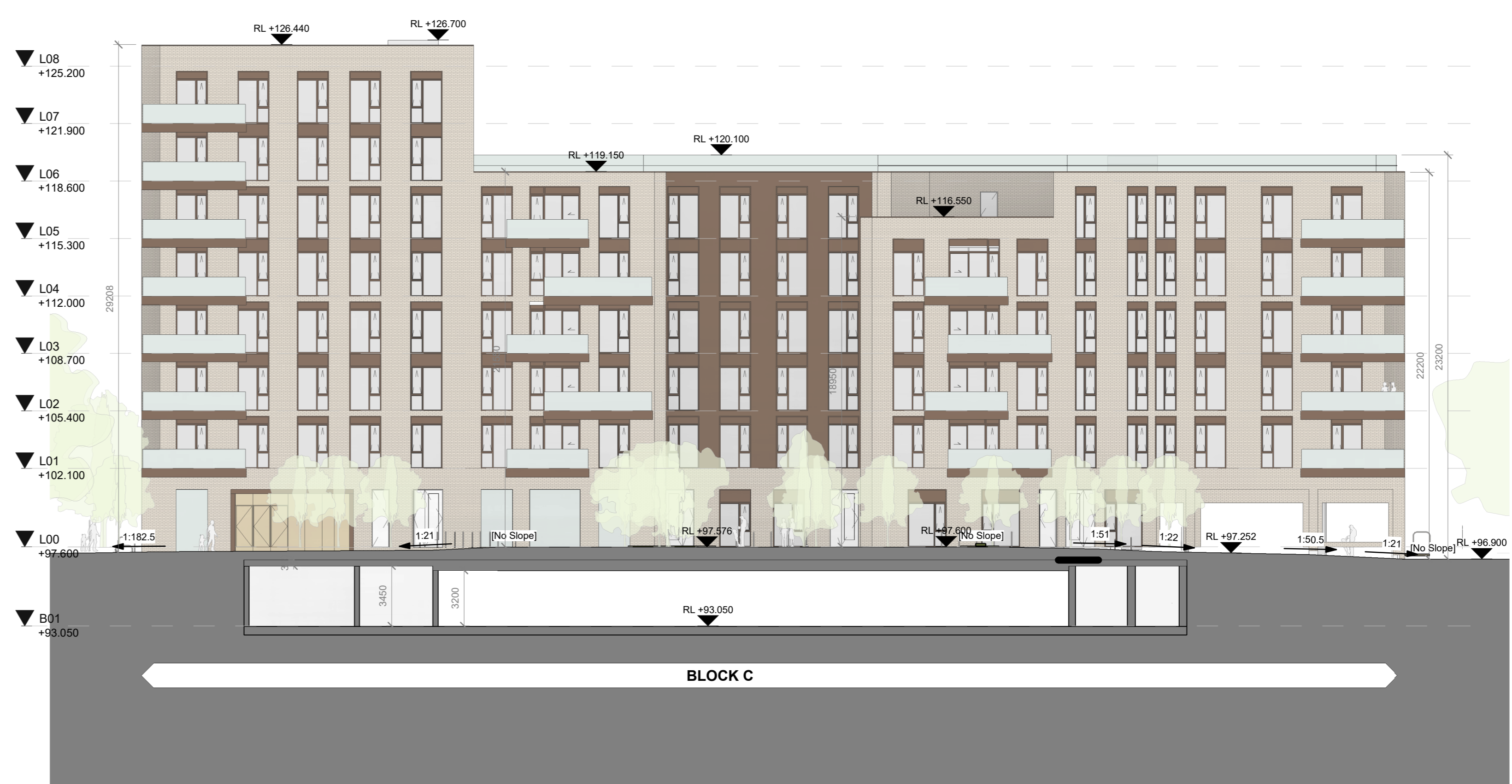
3 BLOCK C NORTH ELEVATION 1 : 200