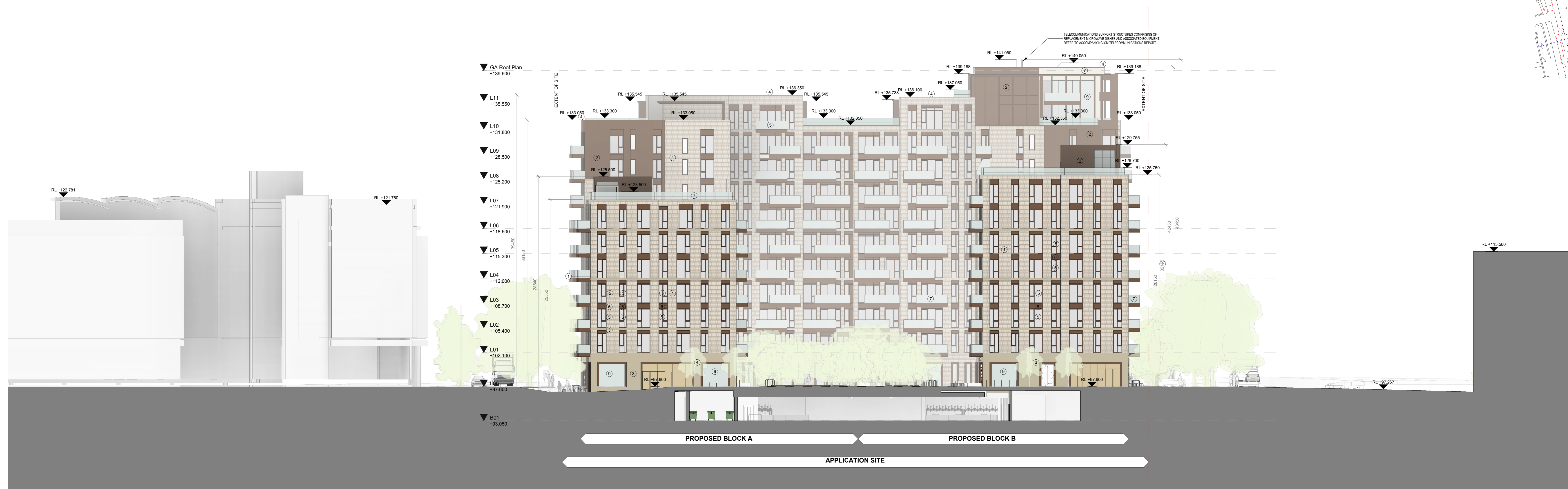
1 PLAZA SECTION NORTH 1 : 200