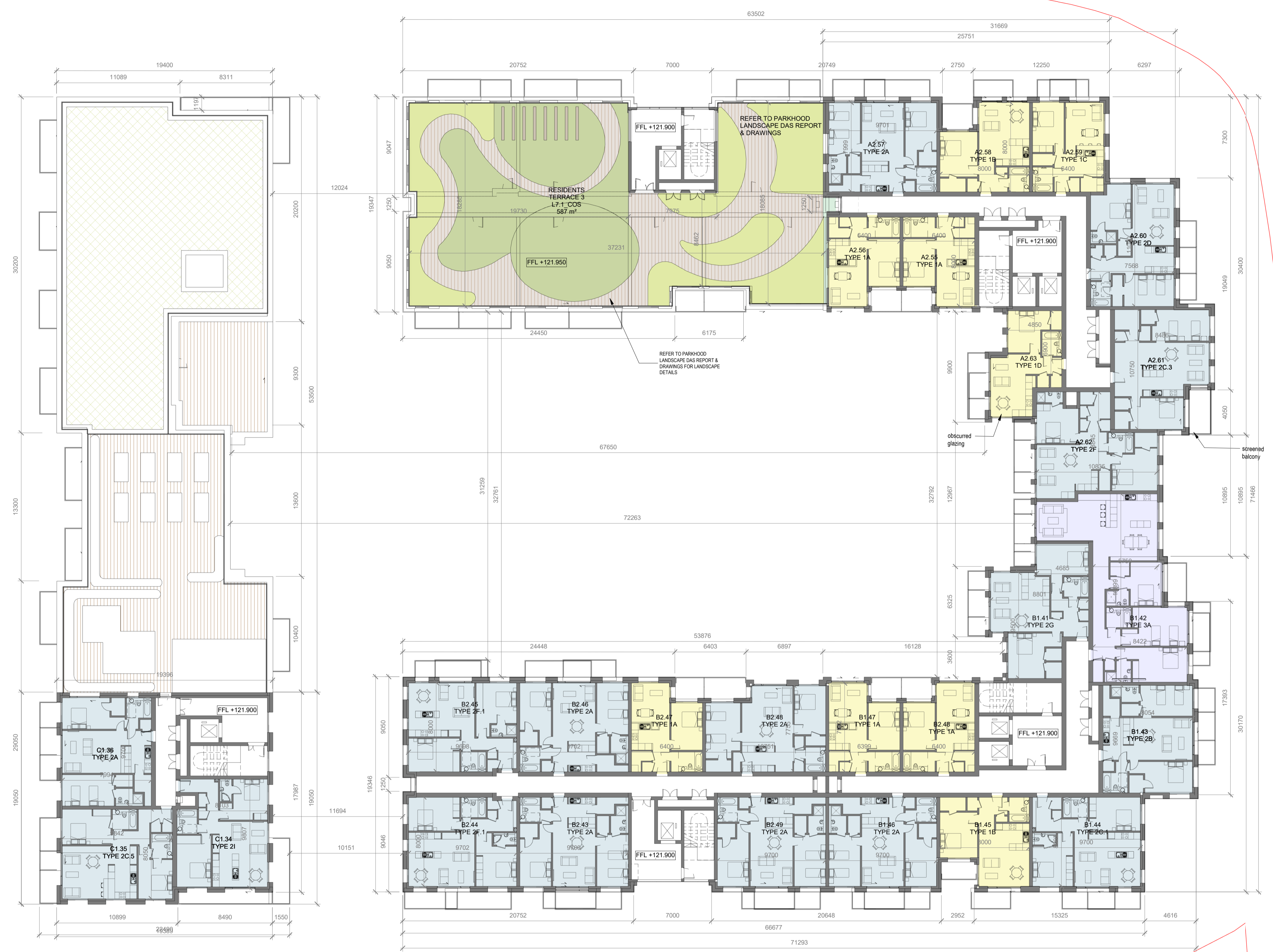
1 GA Plan L07 1 : 200

Architecture + Interiors +353 1 888 3333 51-54 Pearse Street henryjlyons.com info@henryjlyons.com Dublin D02 KA66