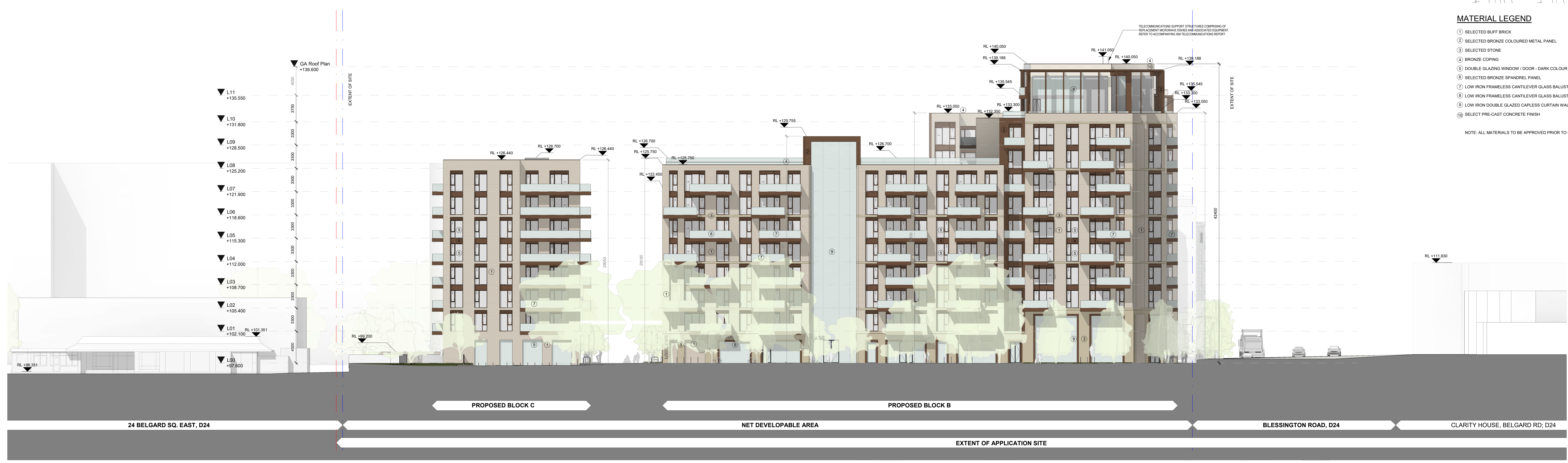
1 EAST ELEVATION 1 : 200

NOTE: ALL MATERIALS TO BE APPROVED PRIOR TO CONSTRUCTION