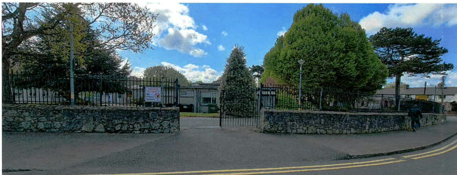
Elevation Mill Lane - Existing - Reference Photo

Suite 1 - Unit 17 Claregalway Corporate Park Galway Tel:0818332200 Fax: (01) 437600 Email: design@corbwell Web: www.corbwell.ie