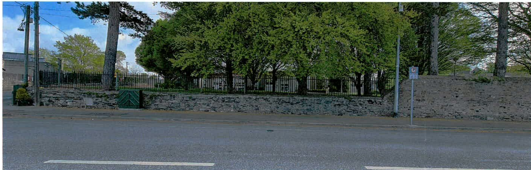
Elevation Lucan Road - Existing - Reference Photo