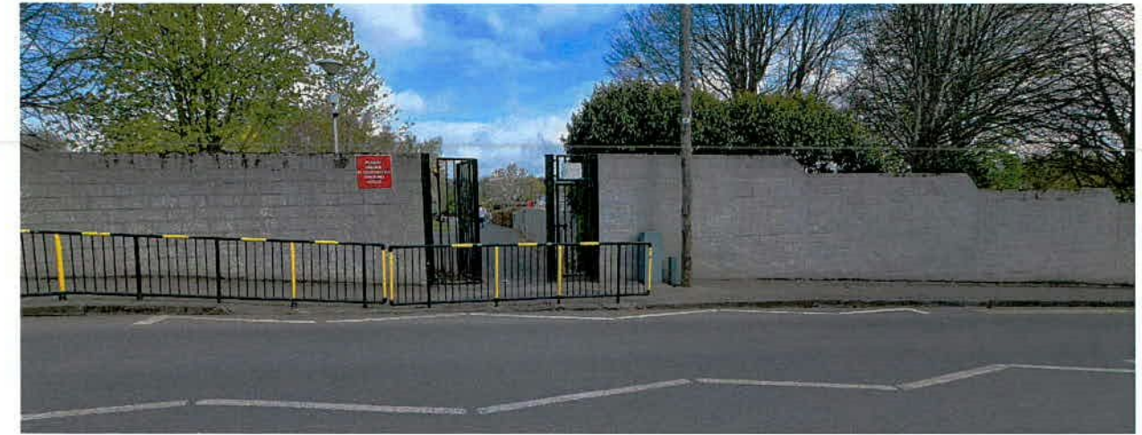
Elevation Mill Lane - Existing Reference Photo