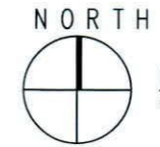
PROPOSED SITE LAYOUT MAP | LICENCE NO: 50269335 scale 1:250 @ A3