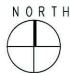
SITE LOCATION MAP | LICENCE NO: 50269335 | 3328-16, -17, -21, -22 | DN018, DN022 | X, Y: 712755, 729671 scale 1:1000 @ A3

EXTENT OF LANDS IN OWNERSHIP OF APPLICATION OUTLINED IN BLUE SITE TO WHICH THIS APPLICATION RELATES OUTLINED IN RED APPROX. LOCATION OF SITE NOTICE