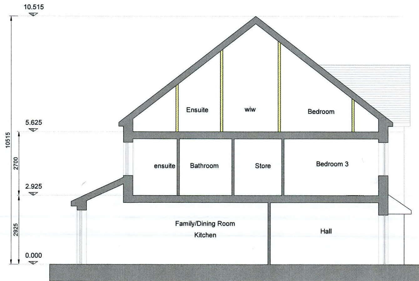
Proposed Section A-A SCALE 1:100