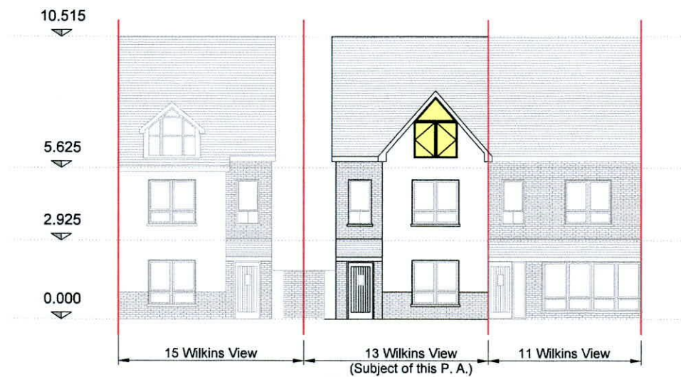
Contiguous Proposed Front Elevation SCALE 1:200