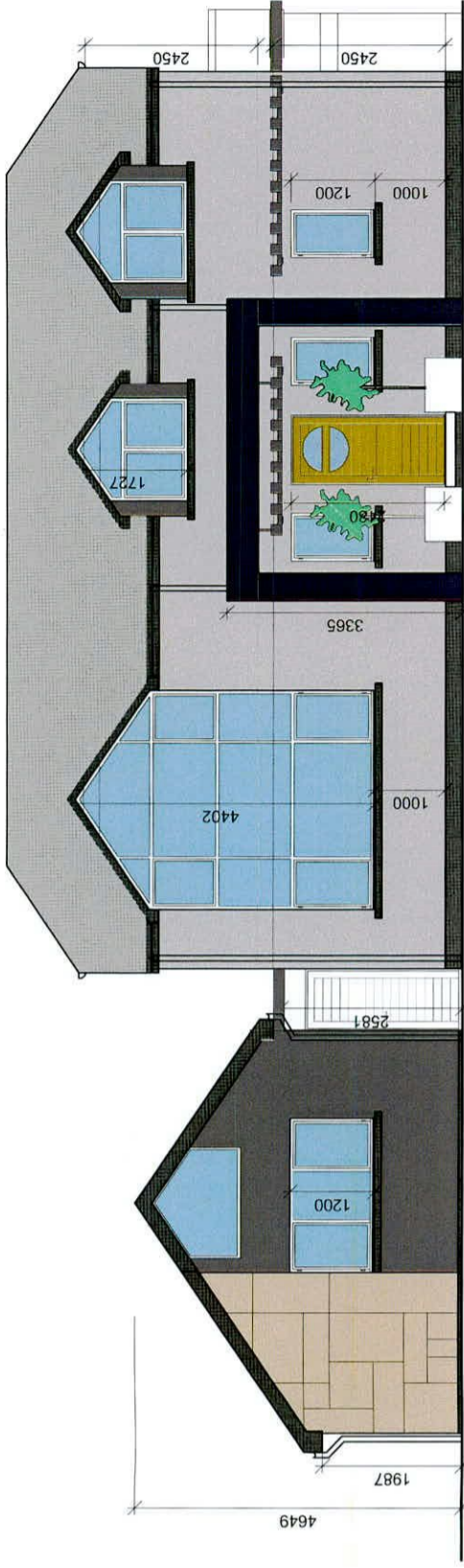
Proposed Side-East Elevation View from the Garden Scale 1:100@ A3