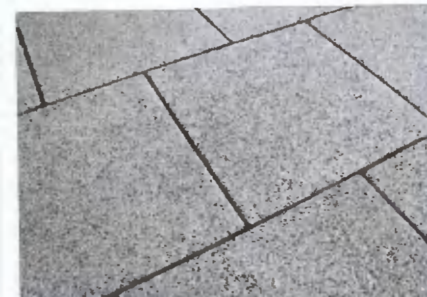
Tobermore Mayfair 'Silver' Paving flag