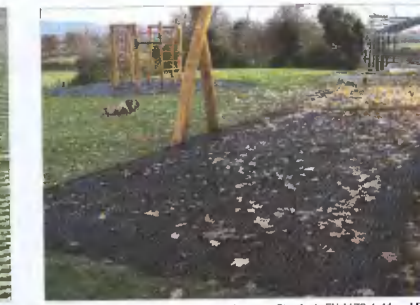
Rubber matting Playground surfacing to European Standards EN 1176-1-11 and EN 1177