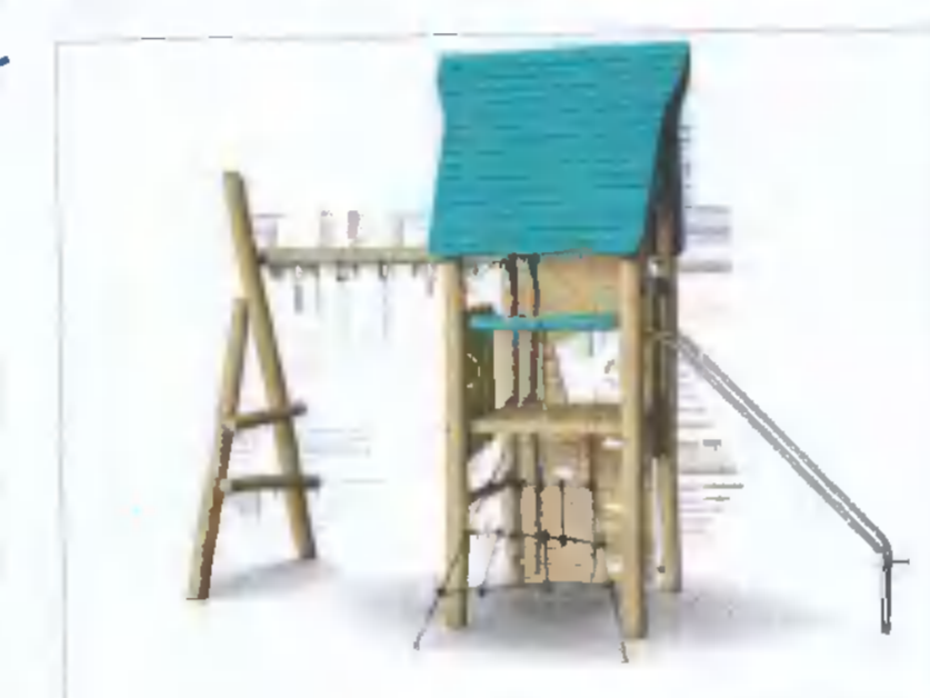
Kompan NFO1014 Monkey Tower