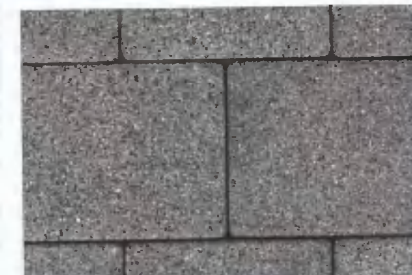
Tobermore Sierra 'Silver' block paving