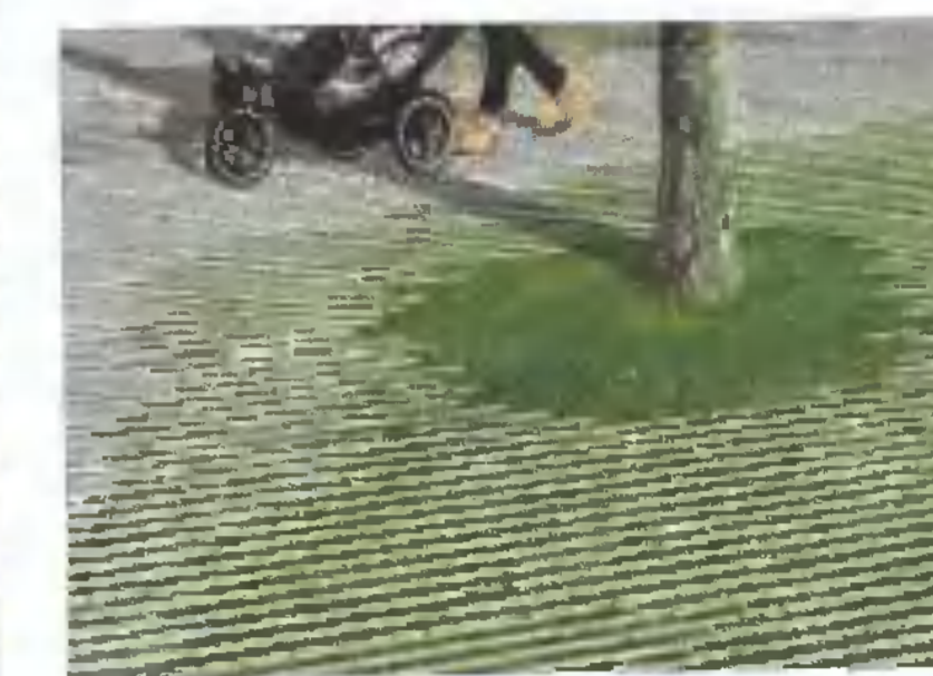
Hydrolineo paving concept