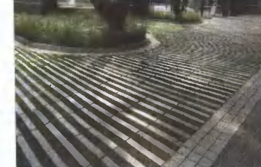
Hydrolineo paving concept