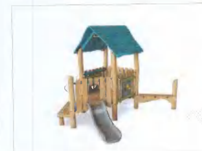
Kompan NFO417 Little Hen House