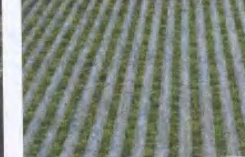
Hydrolineo paving concept