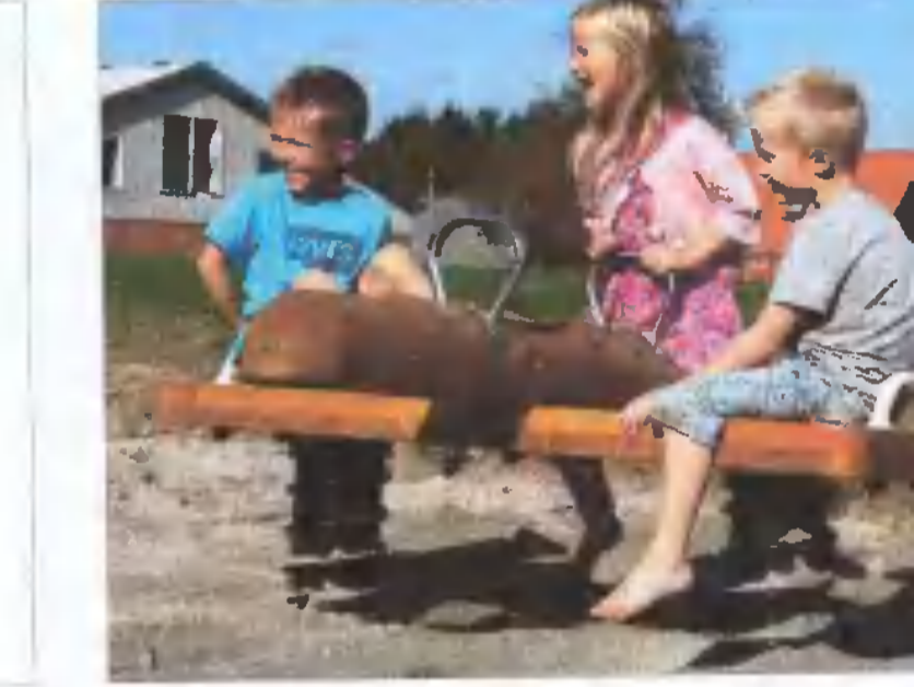
Kompan NFO108 Butterfly seesaw