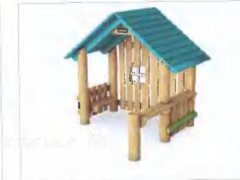
NFO4144 - Play hut with sides and gable