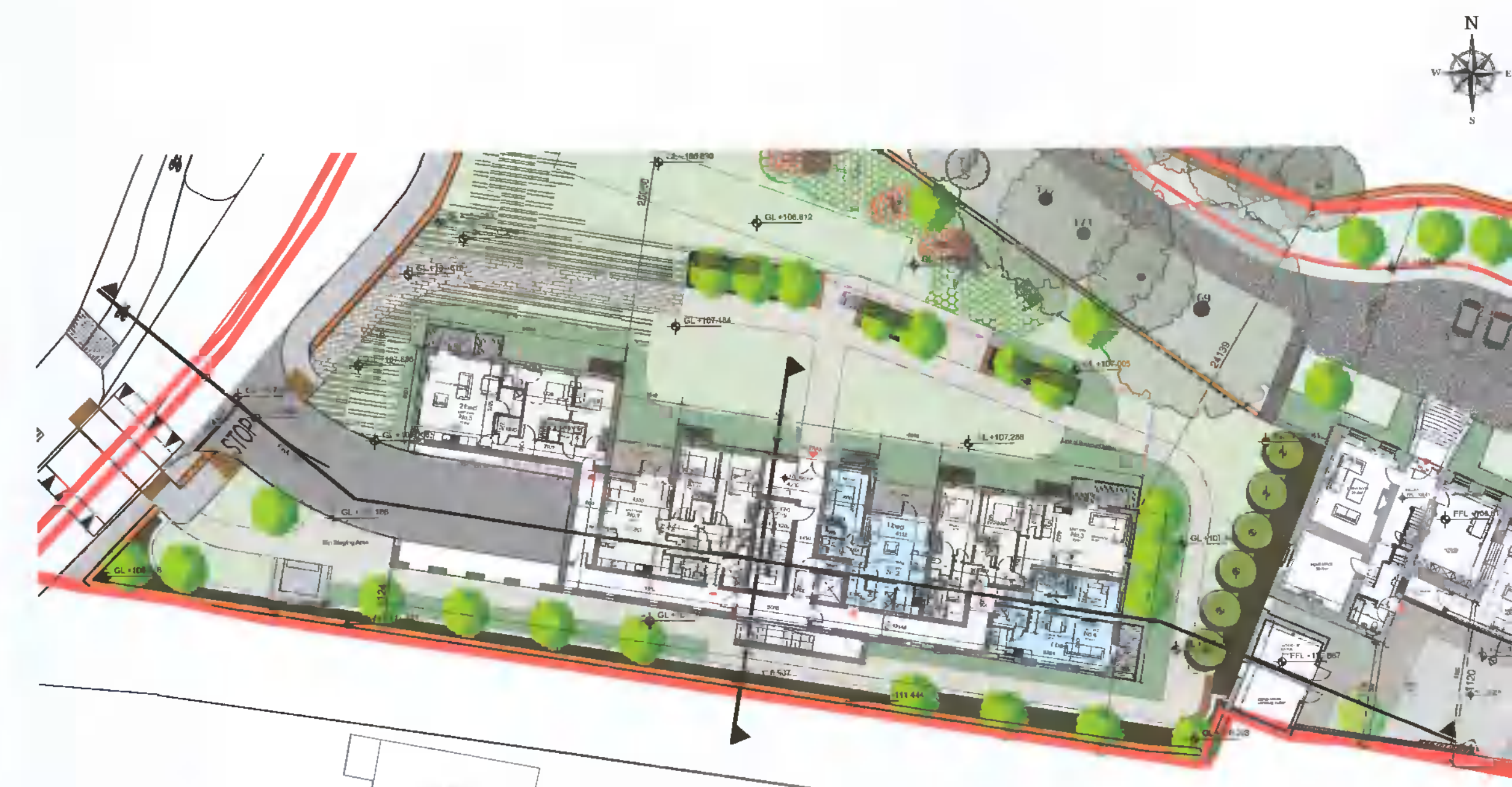
KEY SCALE NTS