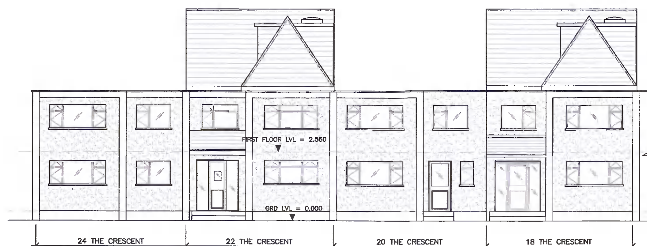
PROPOSED CONTINUOUS FRONT ELEVATION SCALE 1:100