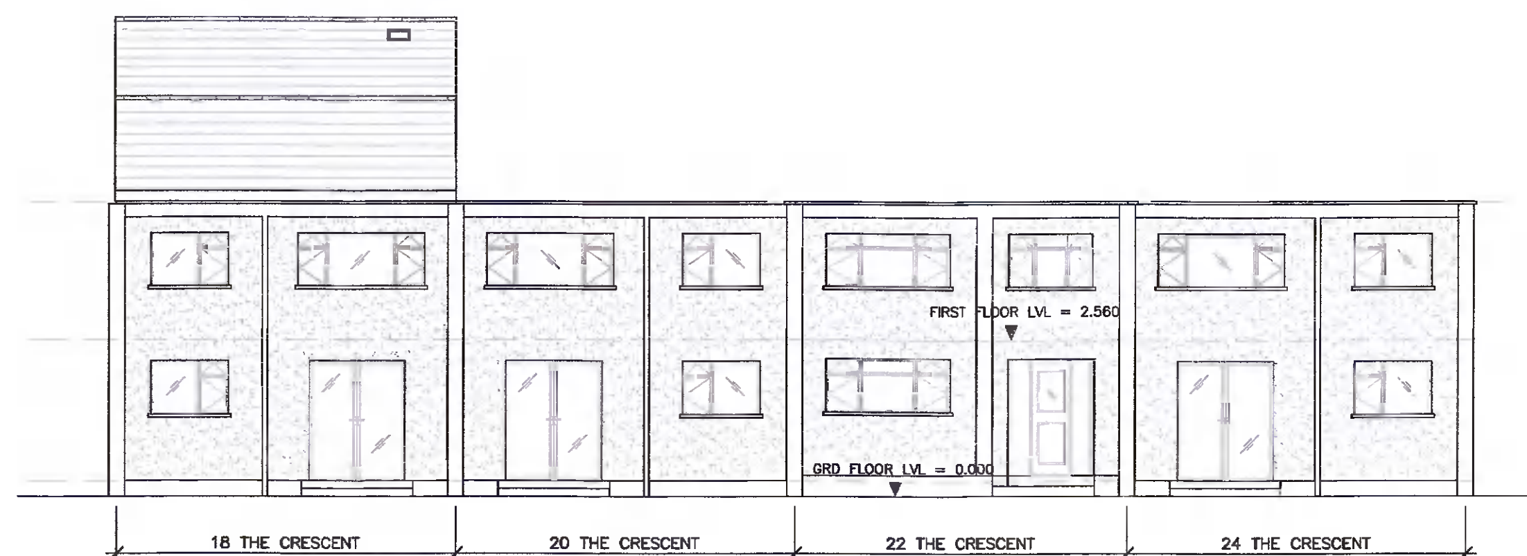
EXISTING CONTINUOUS REAR ELEVATION SCALE 1:100