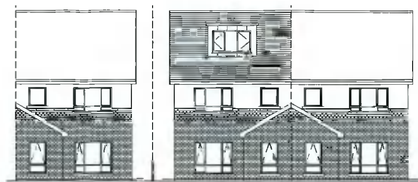
CONTEXTUAL PROPOSED FRONT ELEVATION SCALE: 1:100