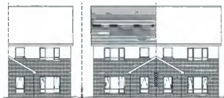
CONTEXTUAL EXISTING FRONT ELEVATION SCALE: 1:100