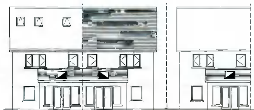
CONTEXTUAL EXISTING REAR ELEVATION SCALE: 1:100