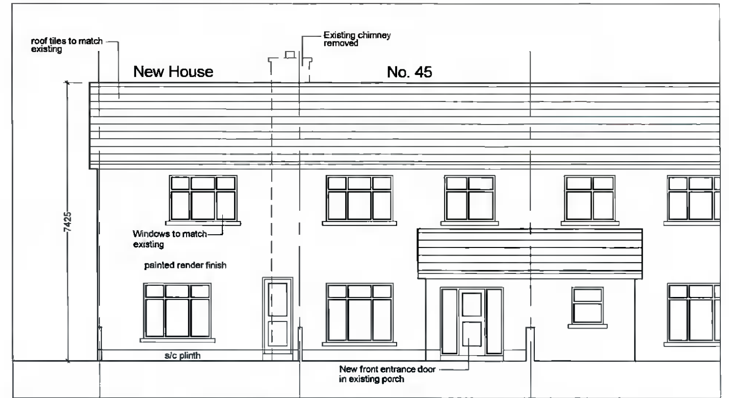
PROPOSED SOUTH-WEST ELEVATION Scale 1:100