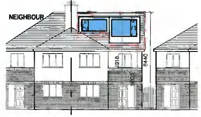
PROPOSED FRONT ELEVATION SCALE : 1:200