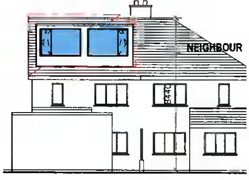
PROPOSED REAR ELEVATION SCALE : 1:200