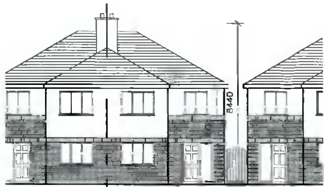
EXISTING FRONT ELEVATION SCALE : 1:200