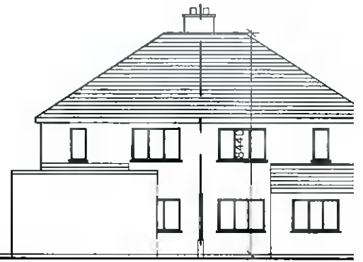
EXISTING REAR ELEVATION SCALE : 1:200