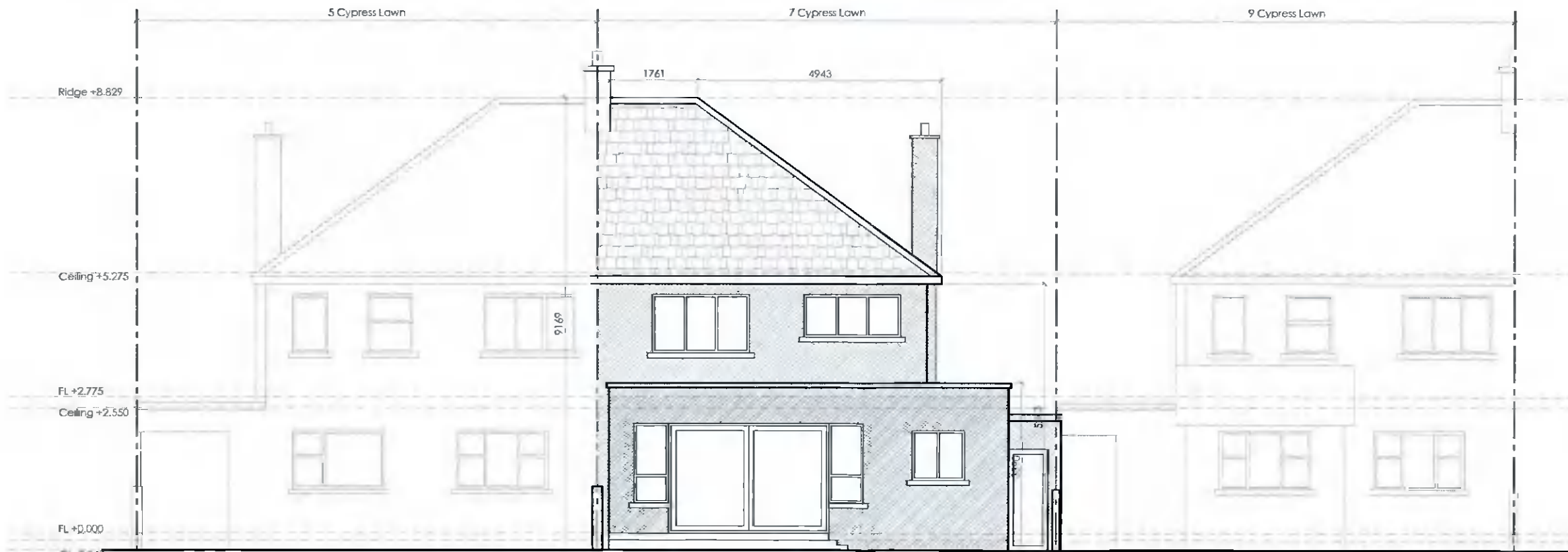
Existing Rear Contiguous Elevation [North] scale 1:100 @ A3