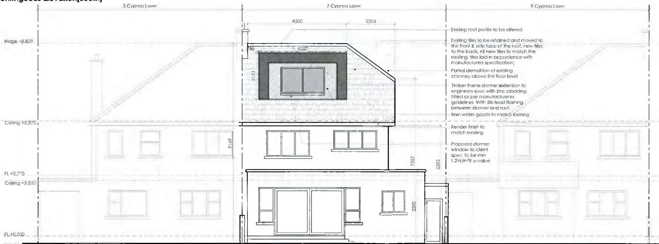
Proposed Rear Contiguous Elevation [North] scale 1:100 @ A3