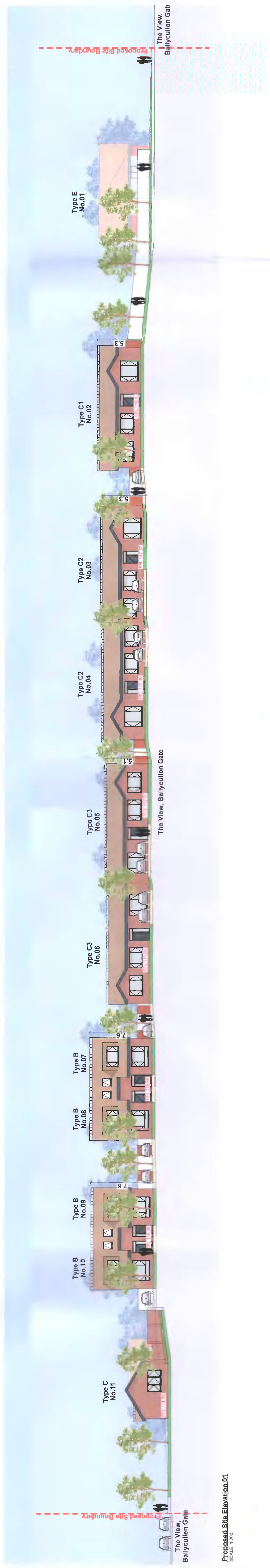
Proposed Site Elevation 01 SCALE: 1:200