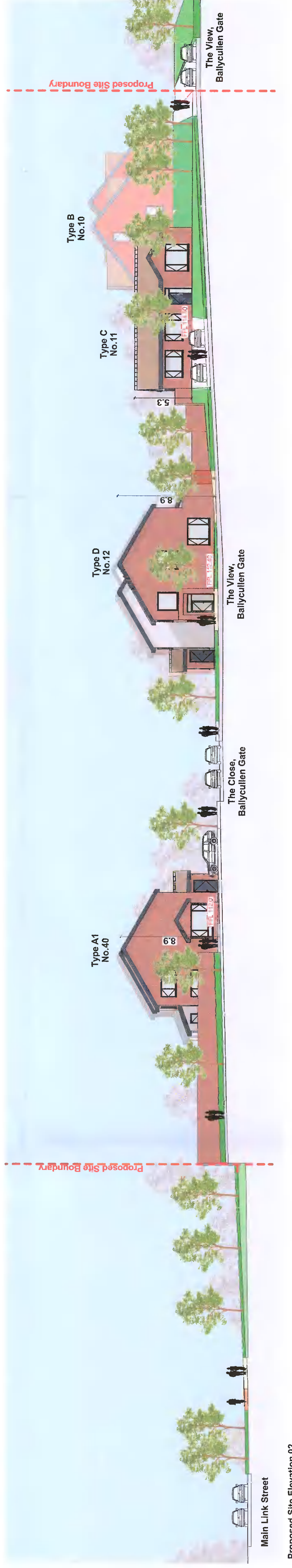
Proposed Site Elevation 02 SCALE: 1:200