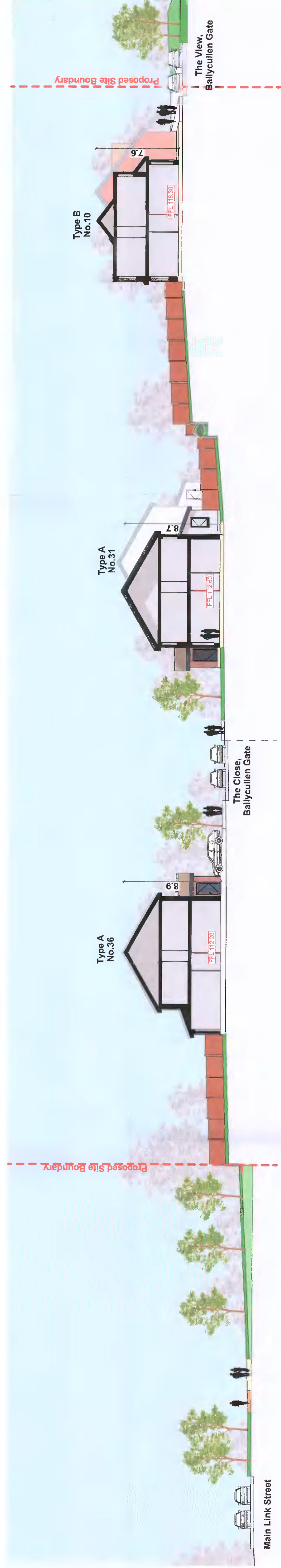
Proposed Site Section 04 SCALE: 1:200