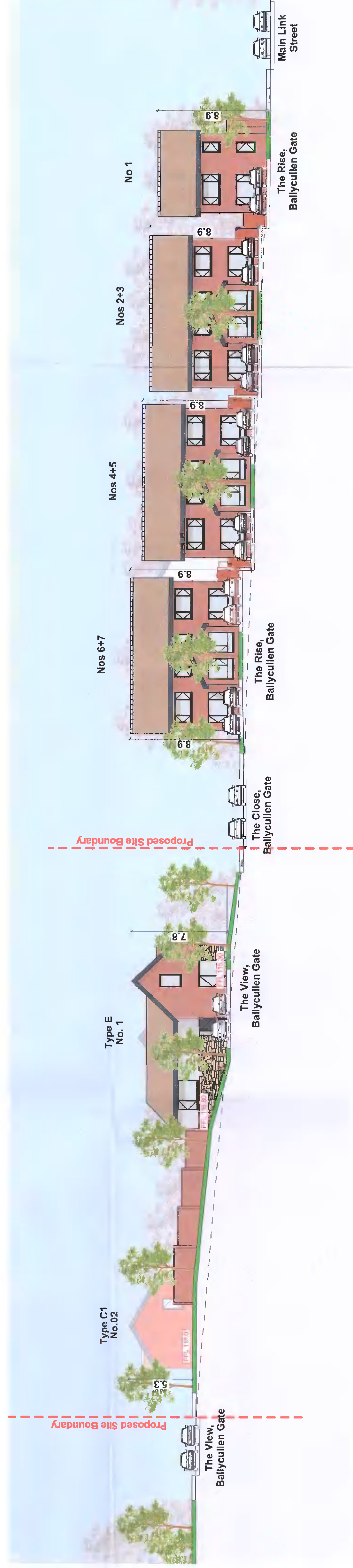
Proposed Site Elevation 03 SCALE: 1:200