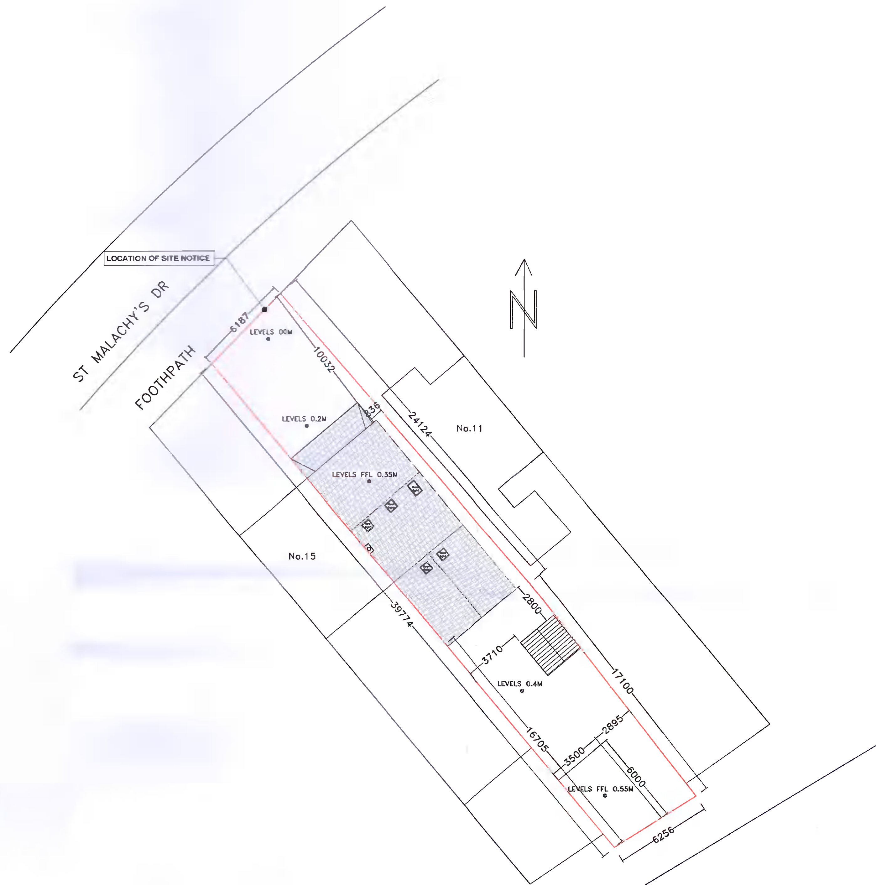
SITE LAYOUT PLAN (EXISTING) SCALE 1:150