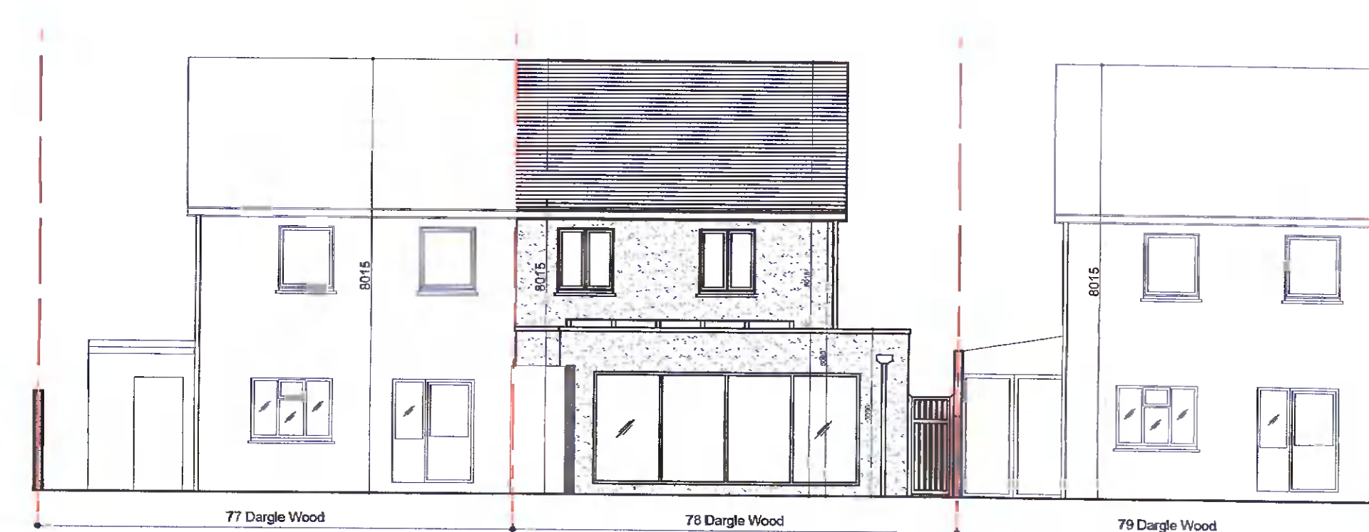
EXISTING REAR CONTIGUOUS ELEVATION 2-2 SCALE: 1:100