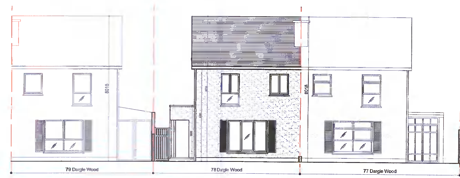
EXISTING GA FRONT GA / CONTIGUOUS ELEVATION 1-1 SCALE: 1:100