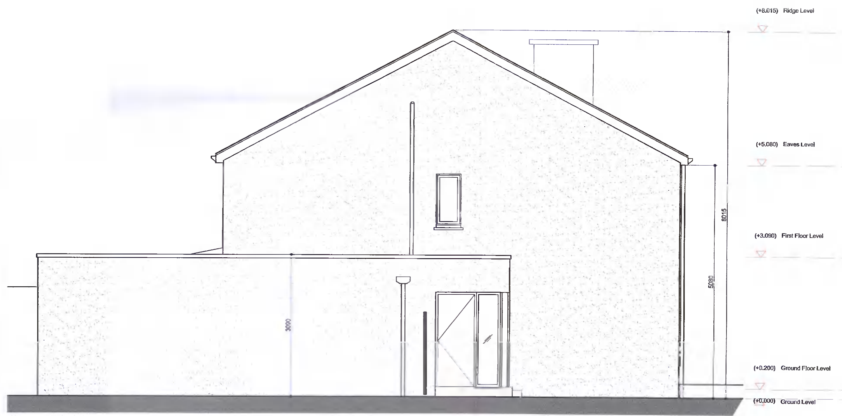
EXISTING GA SECTION ELEV A-A SCALE: 1:50