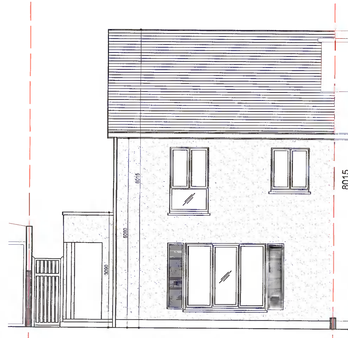
EXISTING GA FRONT ELEVATION 1-1 SCALE: 1:50