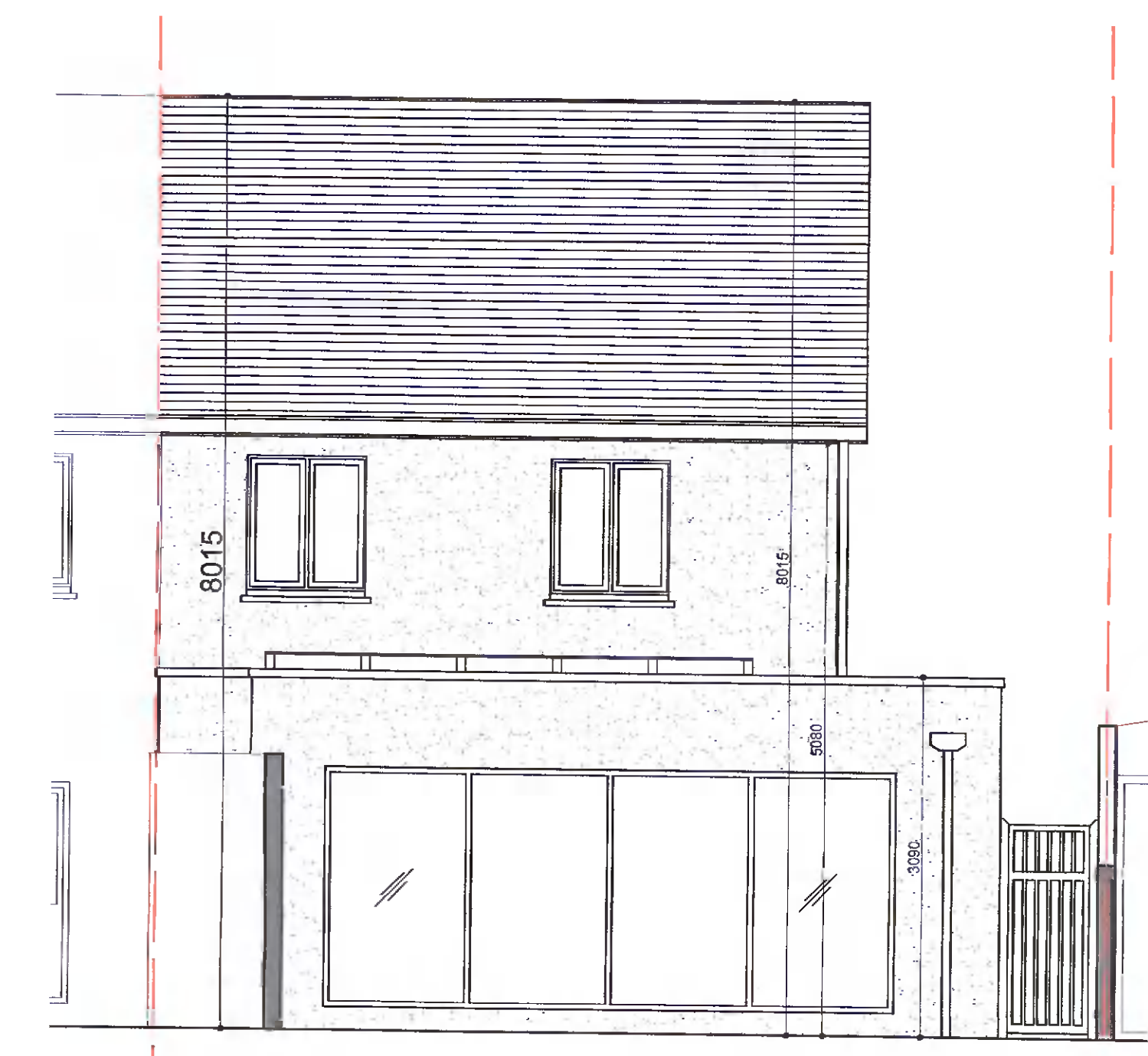
EXISTING GA REAR ELEVATION 2-2 SCALE: 1:50