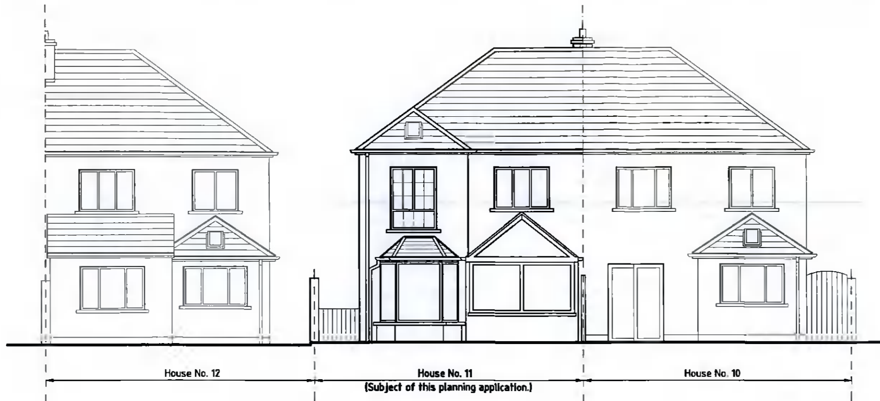
Existing Rear Elevation (South-West) Contiguous.