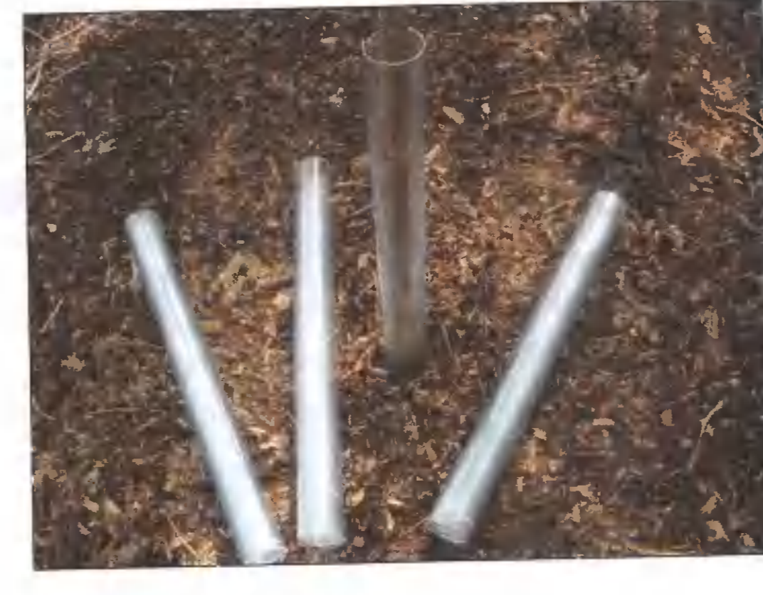
Clear Spiral Tree Guard

Proposed tree planting 44 x Proposed Scot's Pine, Pinus sylvestris r/b, min 450-500cm HT. 82 x Proposed lime trees, r/b, min 5.5m, 20-25cm girth. 98x Proposed birch trees, r/b, min 4.5m, 16-18 cm girth.