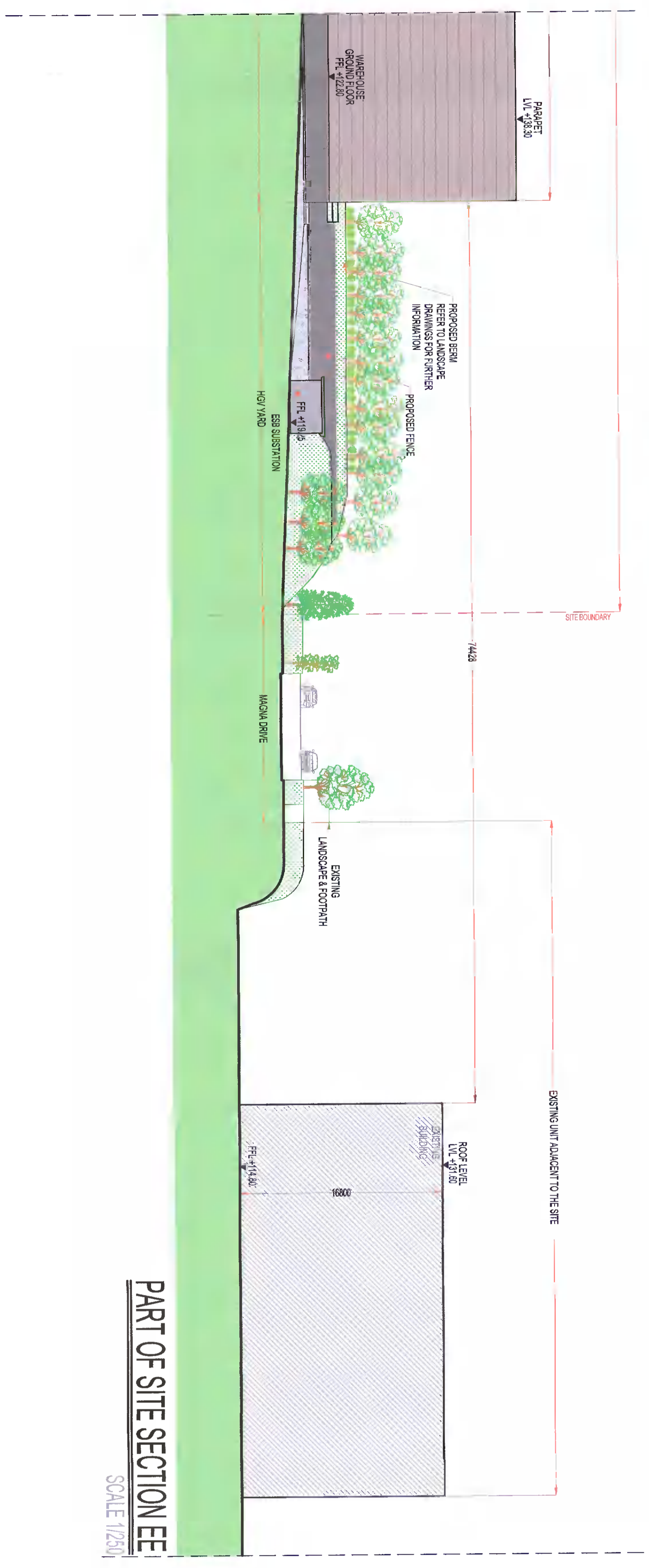
PART OF SITE SECTION EE SCALE 1:1250