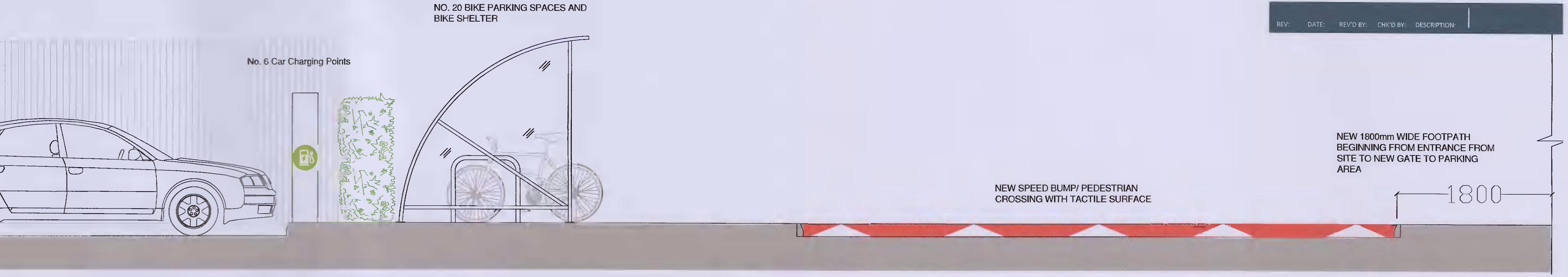
CROSS SECTION THROUGH PARKING AND FOOTPATH AREA A1

NOTE: refer to notes relevant to job stage. DESIGN: All drawings are for discussion purposes only and are not to be used for any other purpose. PLANNING: All drawings are for planning purposes only and are not to be used for any other purpose. Any changes made to these drawings are subject to approval by the engineer/submitter prior to any work commencing. It should also be noted that any changes at this stage can have planning implications. Figured dimensions only to be taken from this drawing. CONSTRUCTION: Drawings are to be checked on site by the contractor before work shall commence. The engineer/submitter is to be informed of discrepancies immediately. Figured dimensions only to be taken from this drawing. NOTE: This drawing is the property of Clarke & Co. and shall not be used, reproduced or disclosed to anyone without prior written permission of Clarke & Co. and shall be returned upon request. DOCUMENT CONTROL (OFFICE USE ONLY) OF 08.10 ISSUE DATE: 26/02/2018 REV: 01