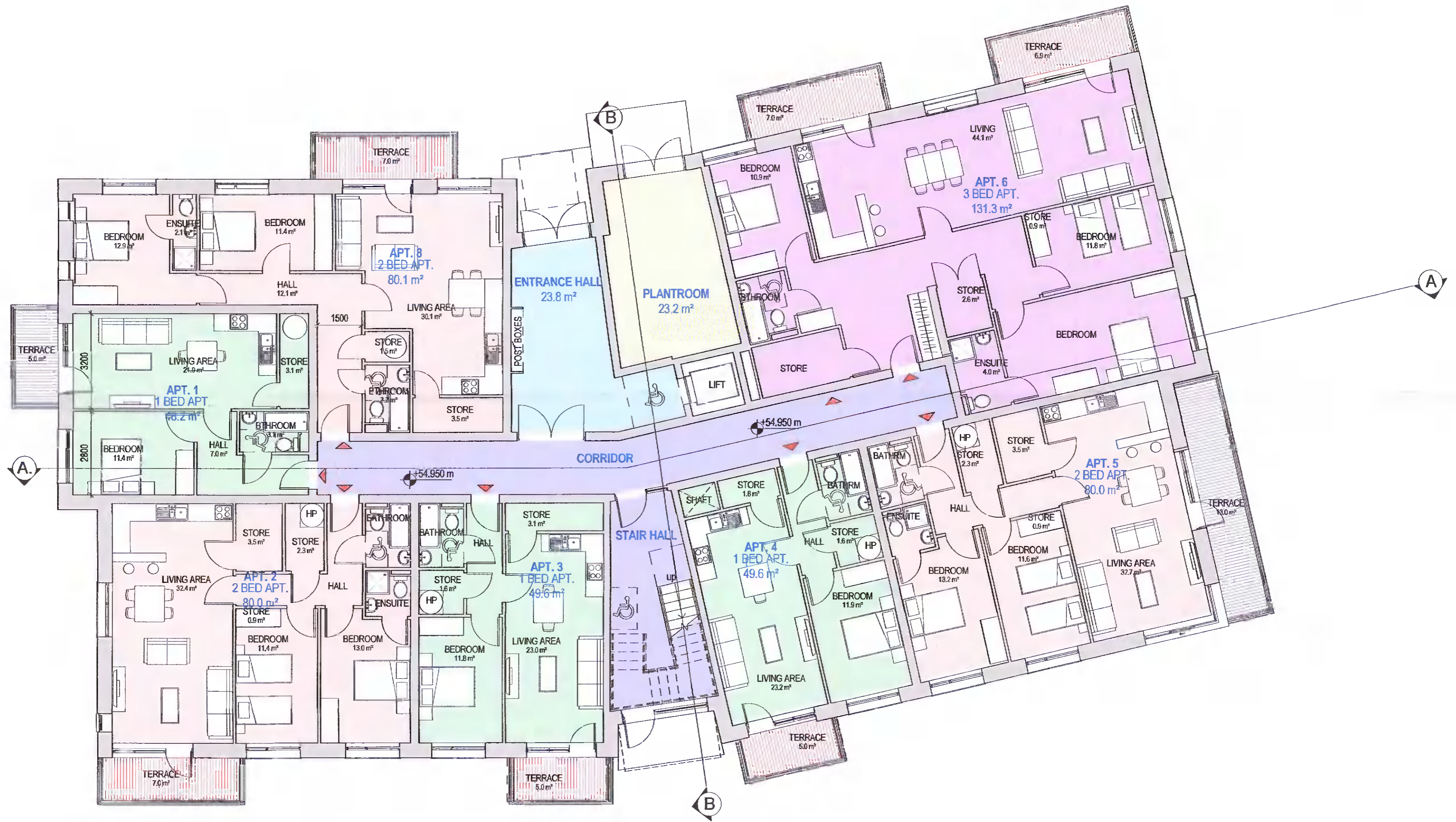
BLOCK 3 GROUND FLOOR PLAN