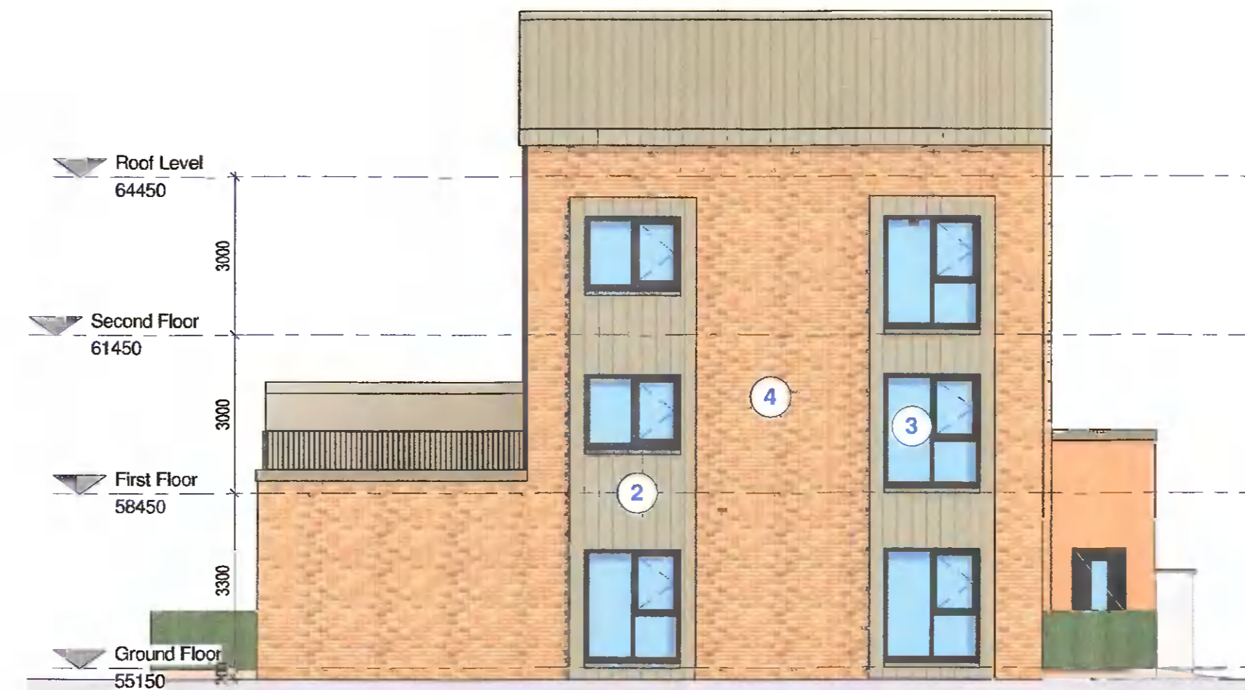
BLOCK 1 SIDE ELEVATION (EAST) 1 : 100