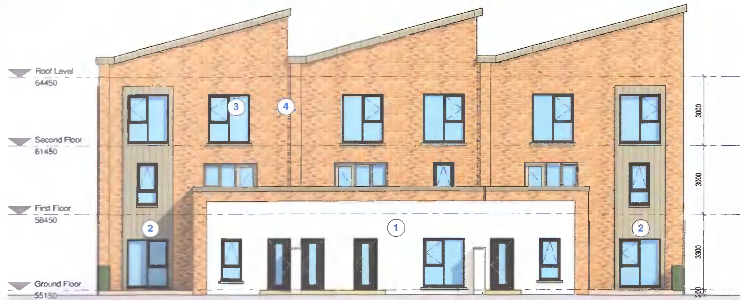
BLOCK 1 FRONT ELEVATION 1 : 100