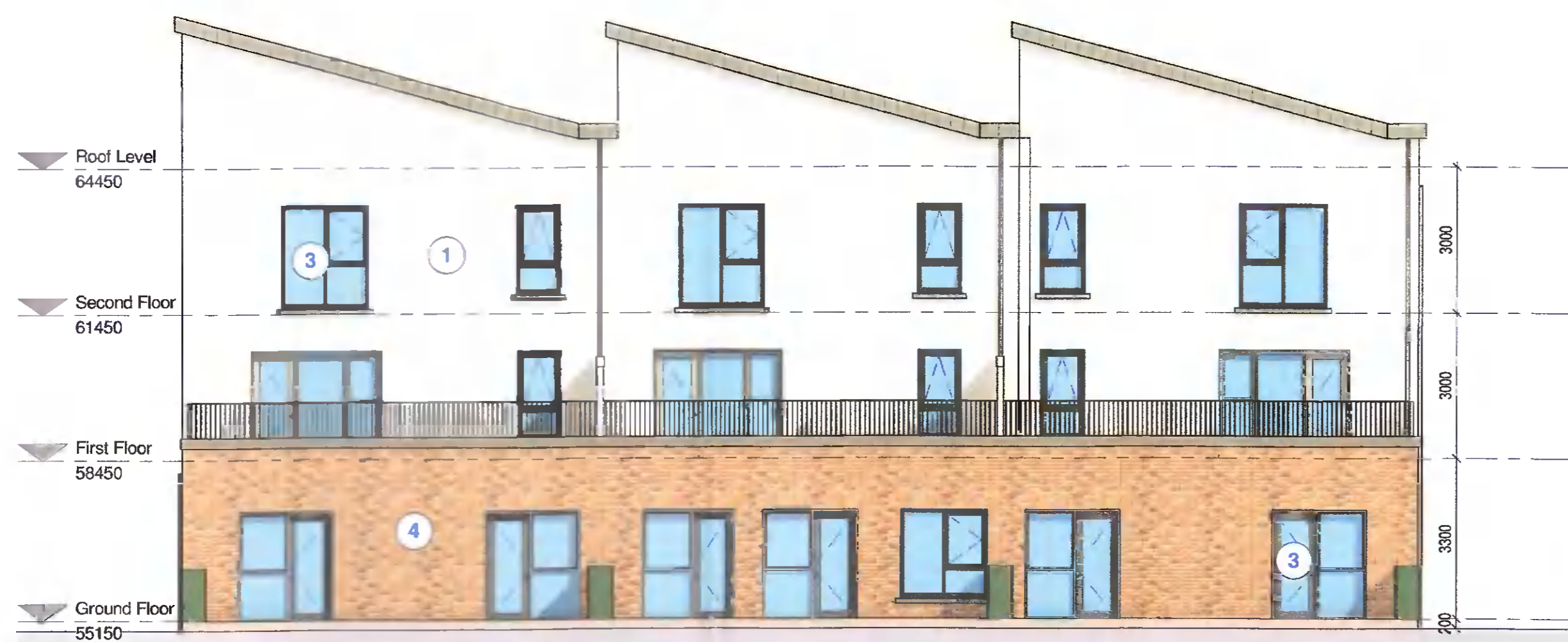
BLOCK 1 REAR ELEVATION 1 : 100