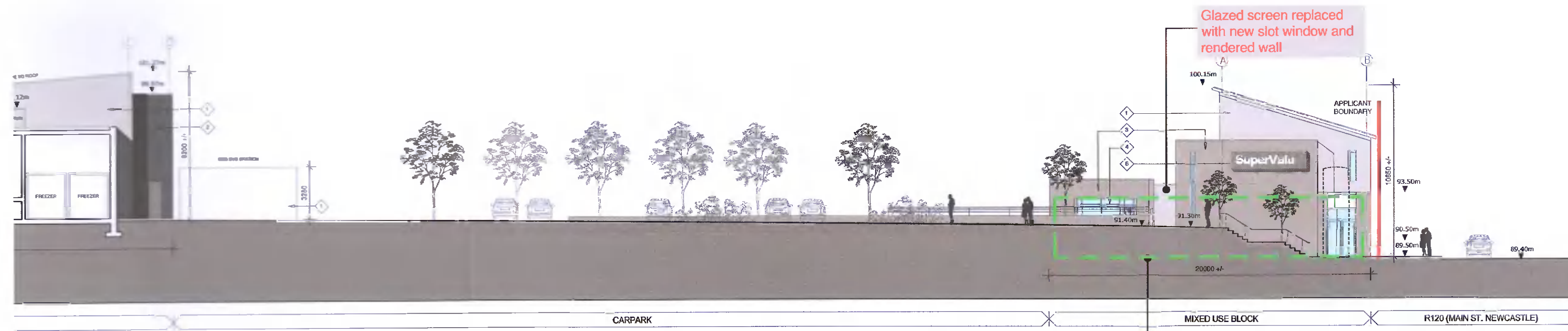
East Elevation - Contiguous Scale 1 : 200 @ A1

RETAIL UNIT Change of use from Cafe Unit to Pharmacy