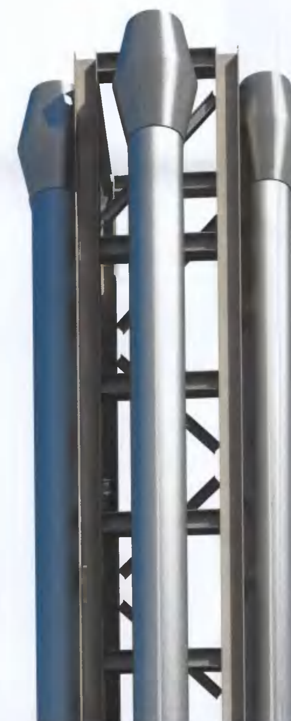
3 OSPG Flue Structure 1 : 1