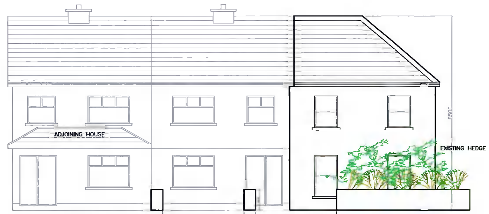
FRONT ELEVATION facing Glenside Drive

ELEVATION NOTES: Nappa Plaster Finish. Blue/Black Concrete Tiles uPVC Doors and Windows