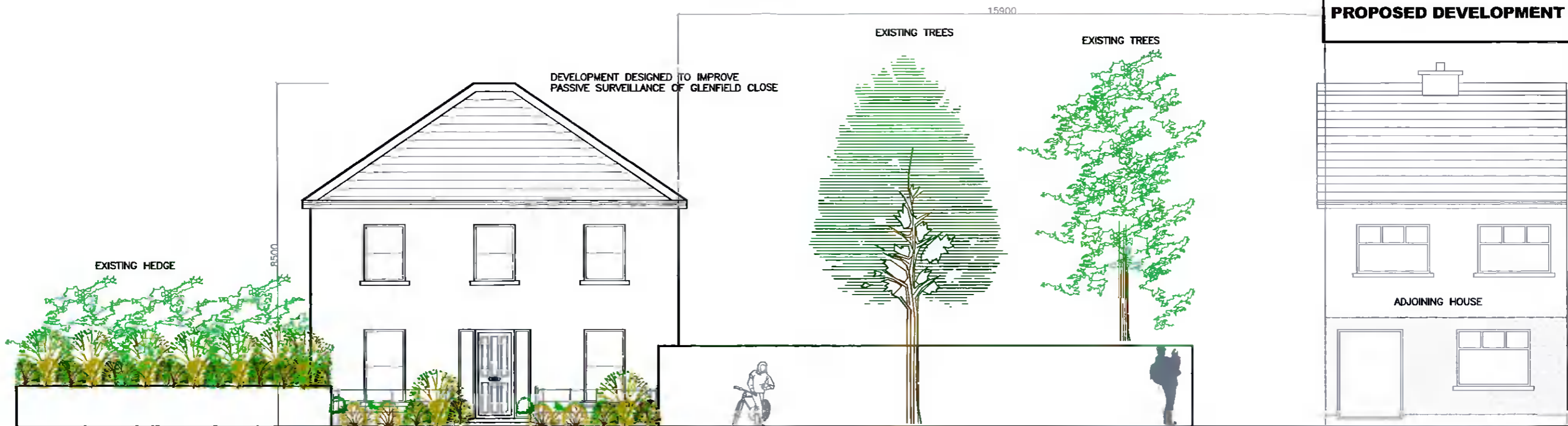
SIDE ELEVATION (and Contiguous Elevation) facing Glenside Close

ELEVATION NOTES: Nappa Plaster Finish. Blue/Black Concrete Tiles uPVC Doors and Windows