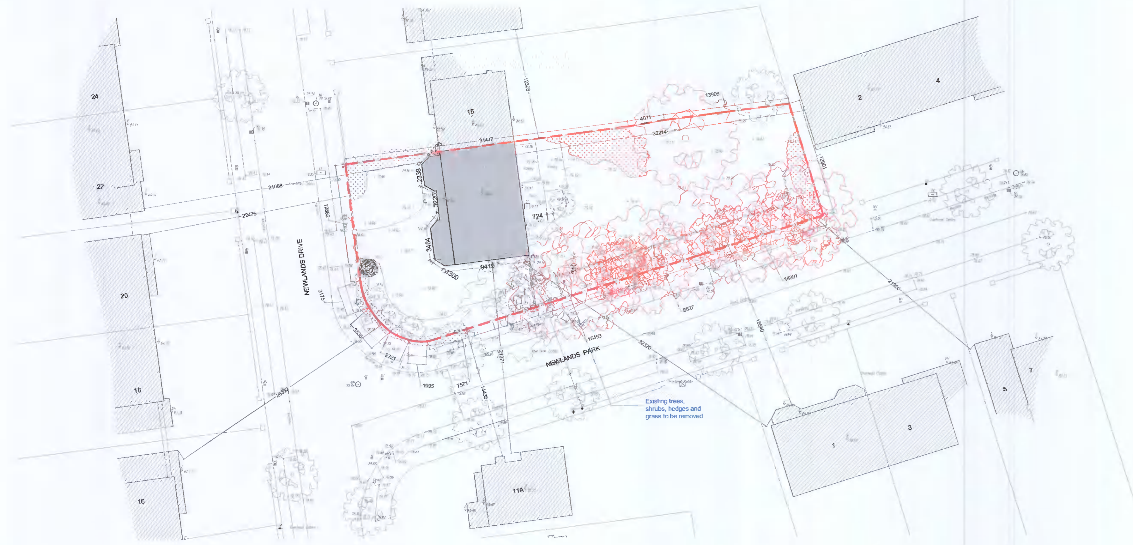
N EXISTING SITE LAYOUT/ DEMOLITION PLAN HIGHLIGHTING THE TREES & HEDGES TO BE REMOVED SCALE 1:250