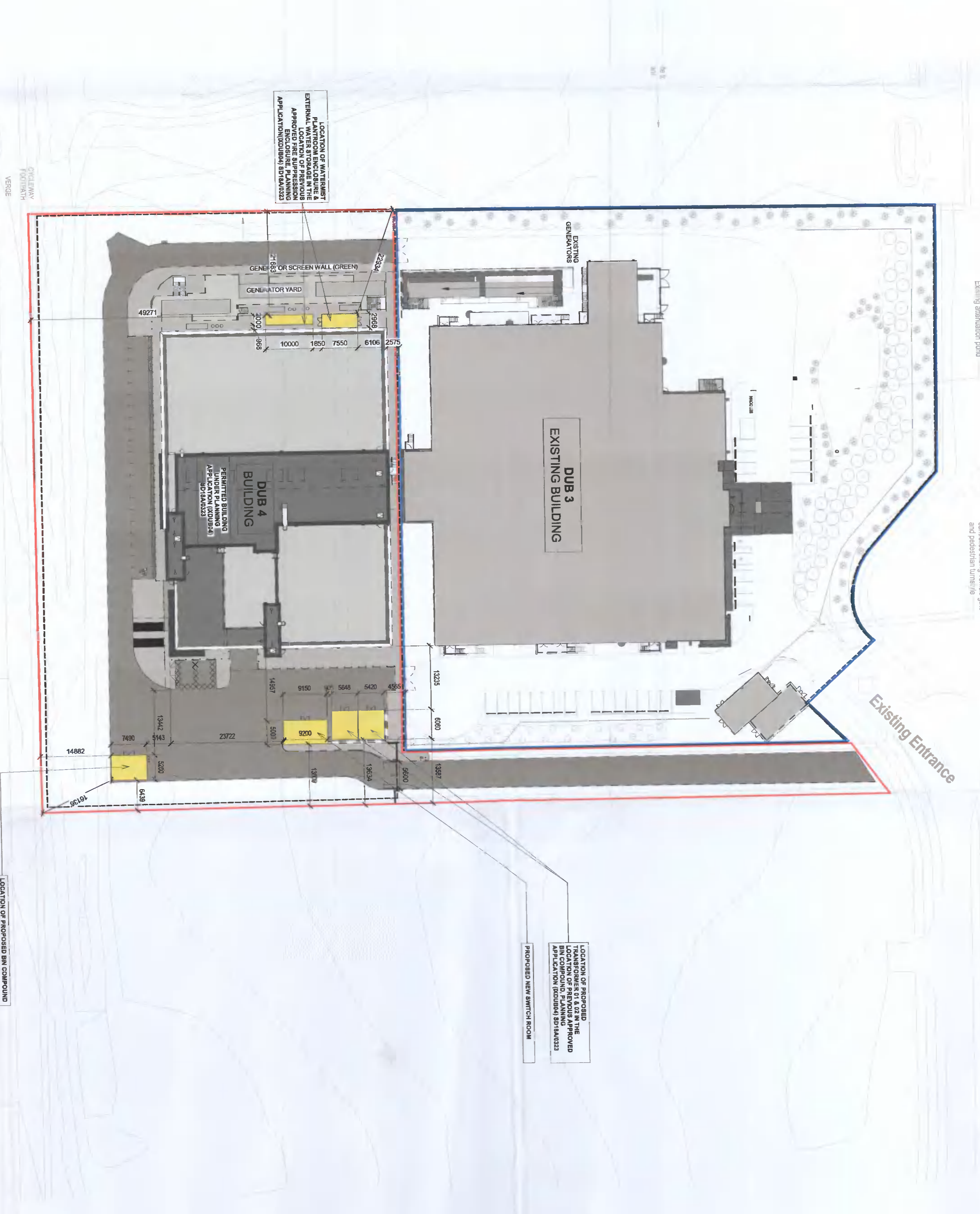
2 SITE PLAN - PROPOSED SCALE: 1:500