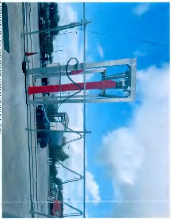
PHOTOGRAPH OF PROPOSED NEW CAR WASH - SIDE