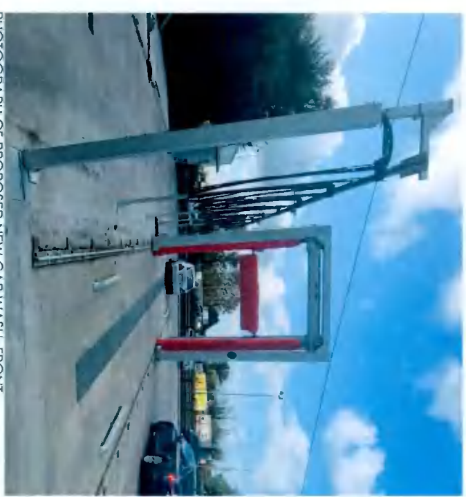
PHOTOGRAPH OF PROPOSED NEW CAR WASH - FRONT