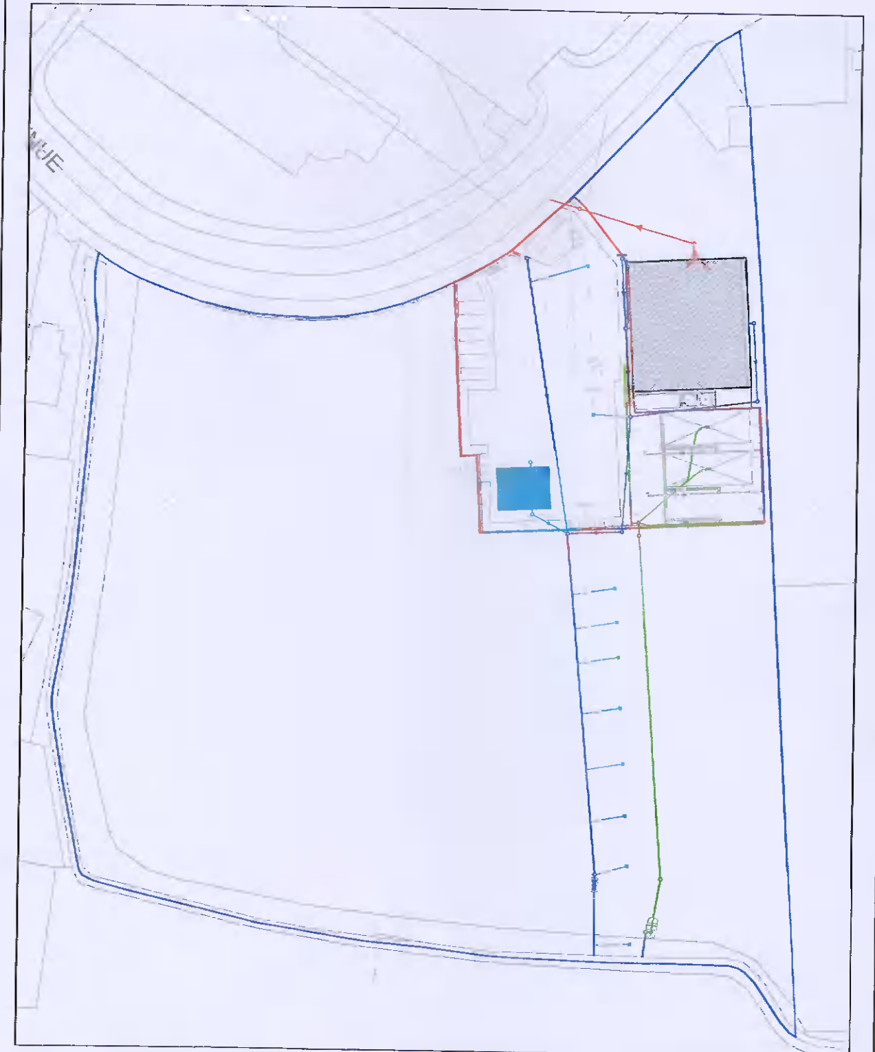
KEY PLAN SCALE 1:1000

NOTES: THIS DRAWING IN WHOLE OR IN PART SHALL NOT BE COPIED WITHOUT THE PRIOR PERMISSION OF McArdle DOYLE LTD. ALL WORKS TO COMPLY WITH THE CURRENT BUILDING REGULATIONS. DO NOT SCALE. ORDNANCE SURVEY IRELAND LICENCE No. AR 0105719 © ORDNANCE SURVEY IRELAND / GOVERNMENT OF IRELAND