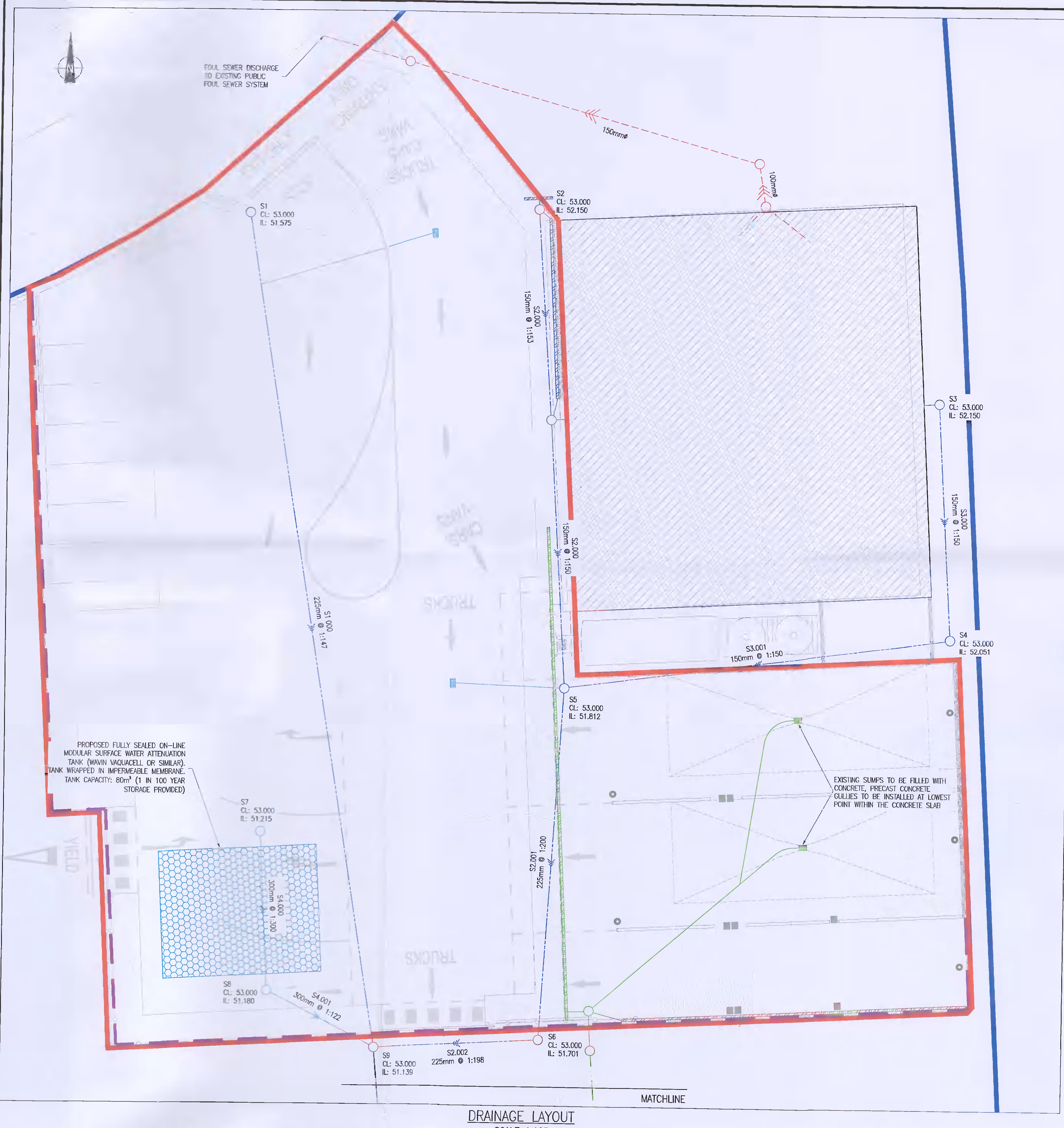
DRAINAGE LAYOUT SCALE 1:125