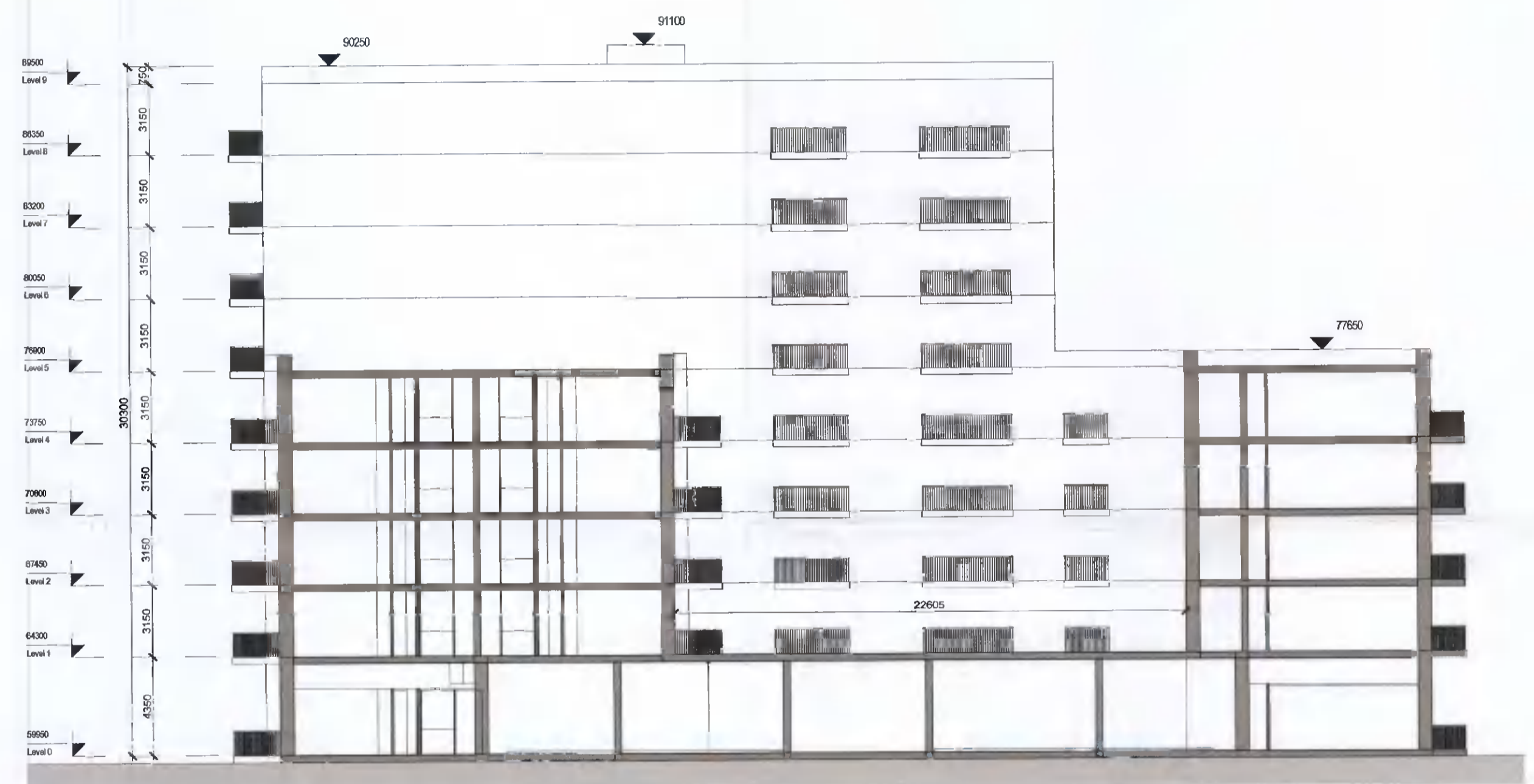
2 Section 2 Scale: 1 : 200