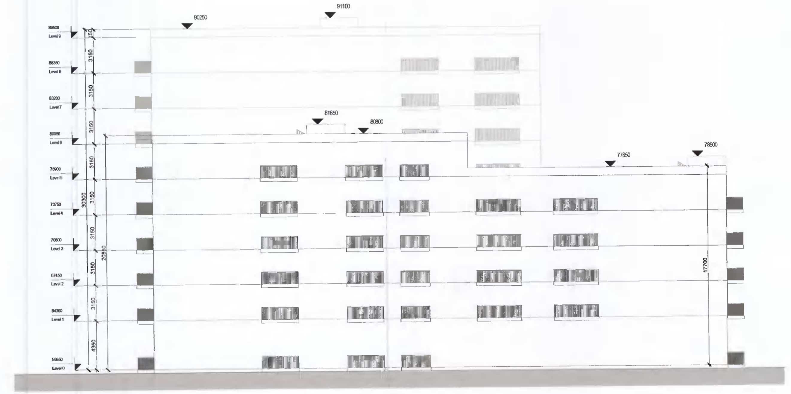
4 South Elevation Scale: 1:200