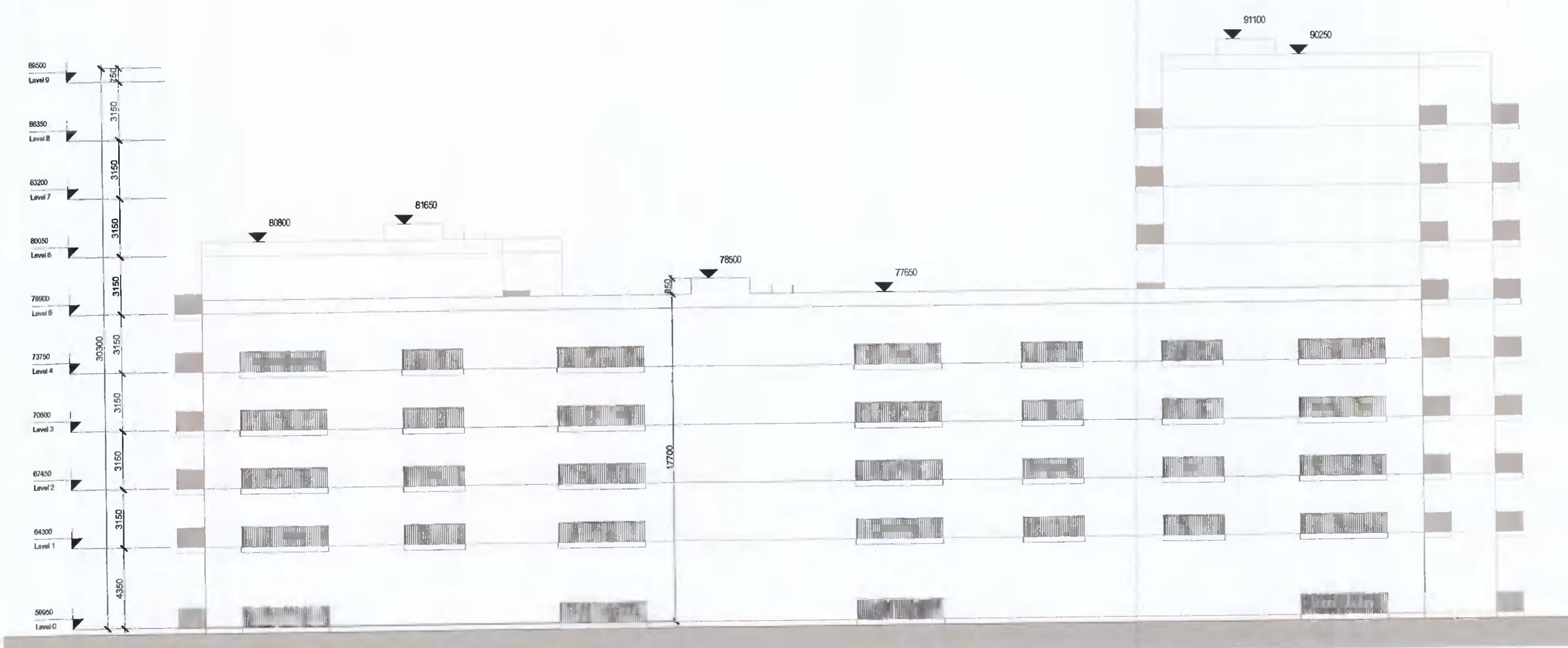
3 West Elevation Scale: 1:200