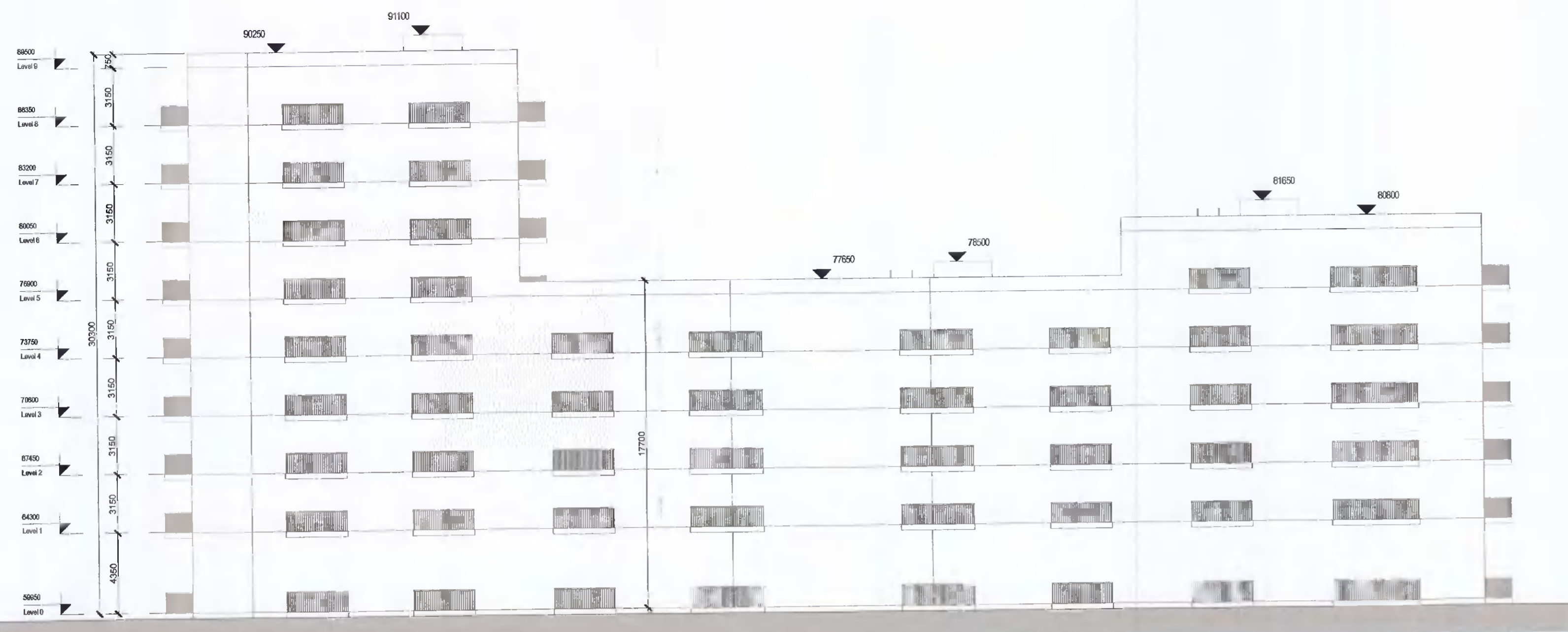
1 East Elevation Scale: 1:200